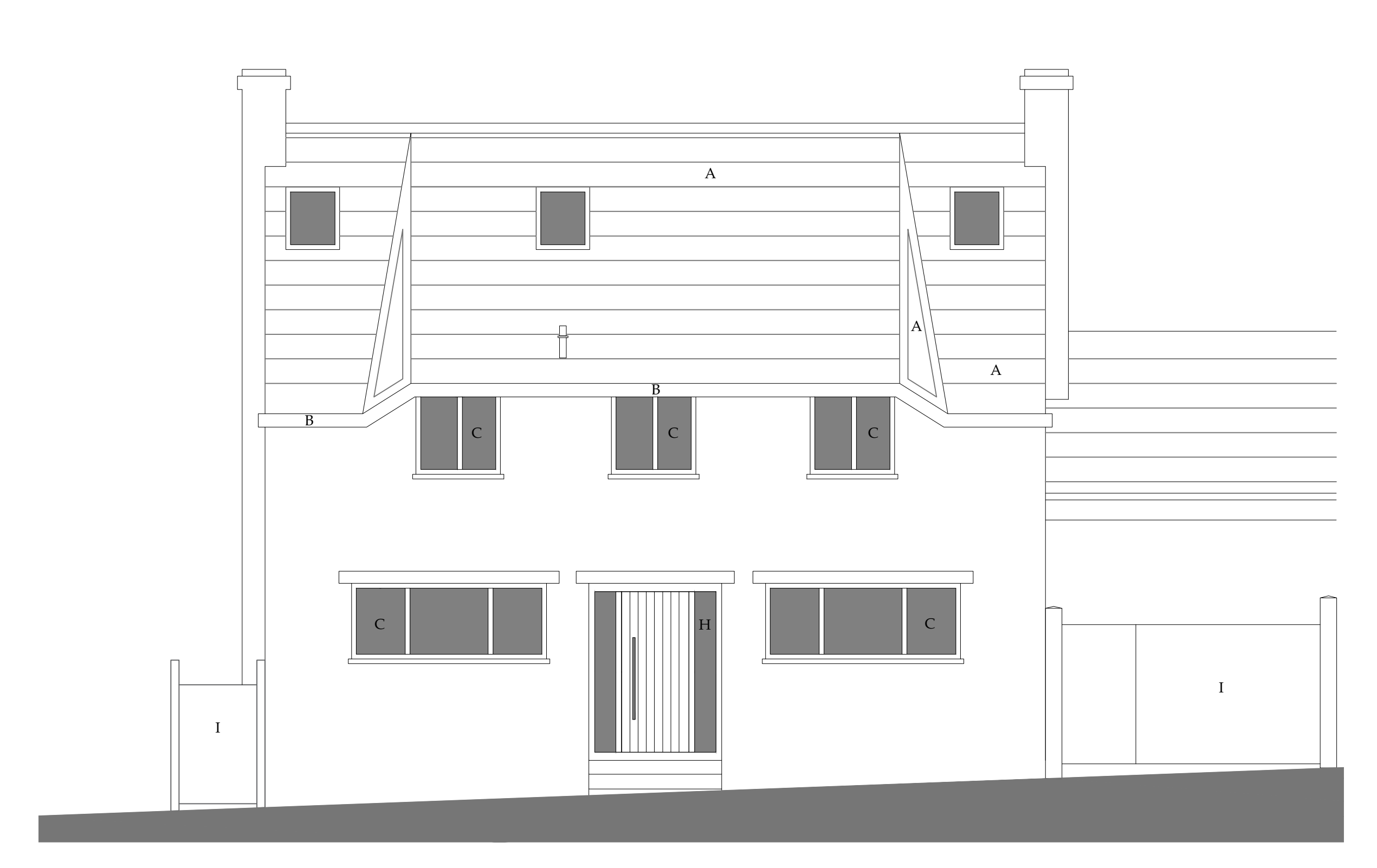
EAST ELEVATION (FRONT) - SCALE 1:50 @ A1