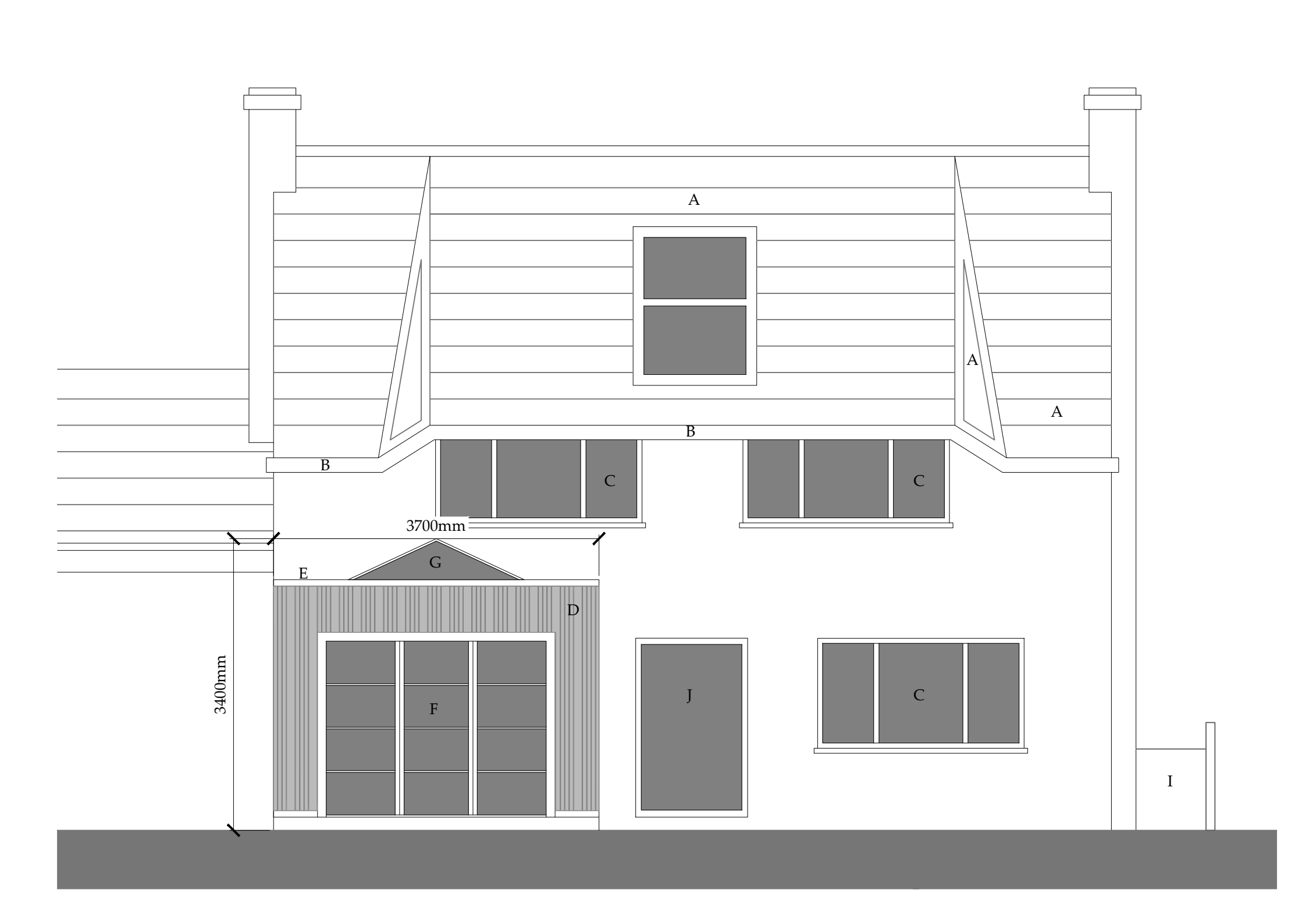
WEST ELEVATION (REAR) - SCALE 1:50 @ A1