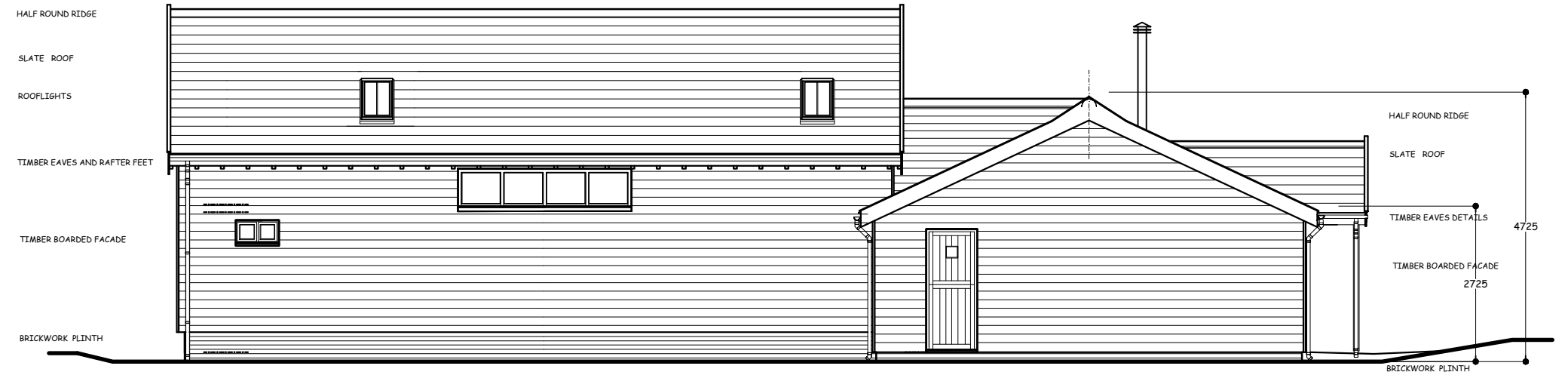
EAST ELEVATION - PROPOSED - scale 1/100

B DEC 21 PLANNING APPLICATION A DEC 21 CLIENTS REVISIONS No. Date Revisions Revisions