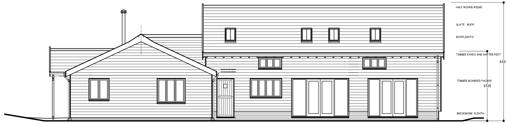
WEST ELEVATION - PROPOSED - scale 1/100