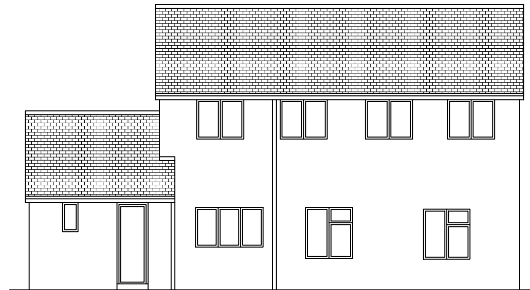
EXISTING NORTH FACING ELEVATION