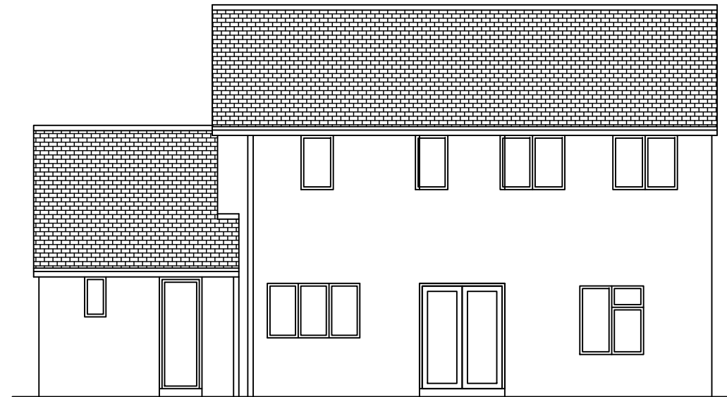
PROPOSED NORTH FACING ELEVATION