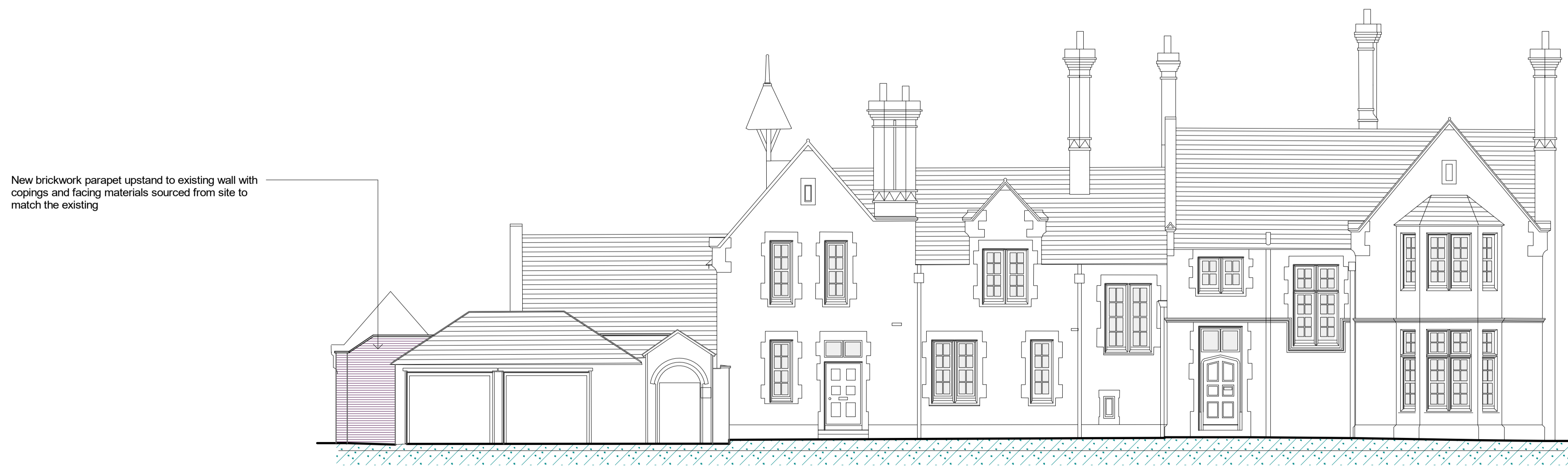
Front Elevation from Driveway (North West)