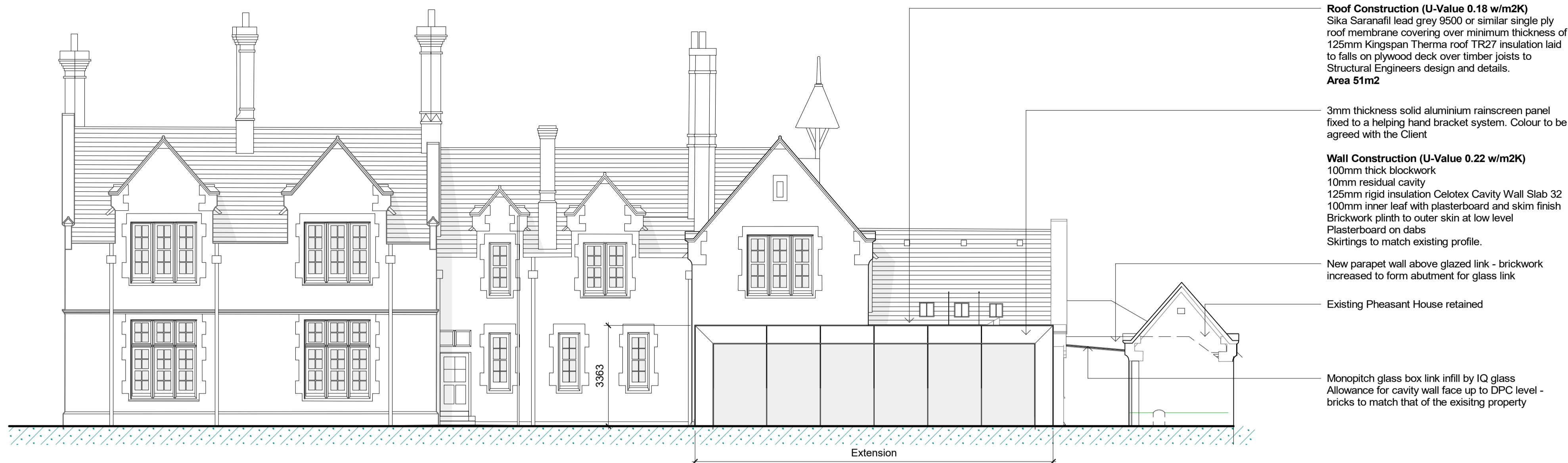
Rear Elevation (South East)

NOTES The copyright of this drawing and design is from T&M and must not be copied or reproduced without written consent. All dimensions to be checked and verified on site via a responsible contractor prior to commencement of any works. This drawing to be read in conjunction with the specification and other drawings. Do not scale to ascertain dimensions.