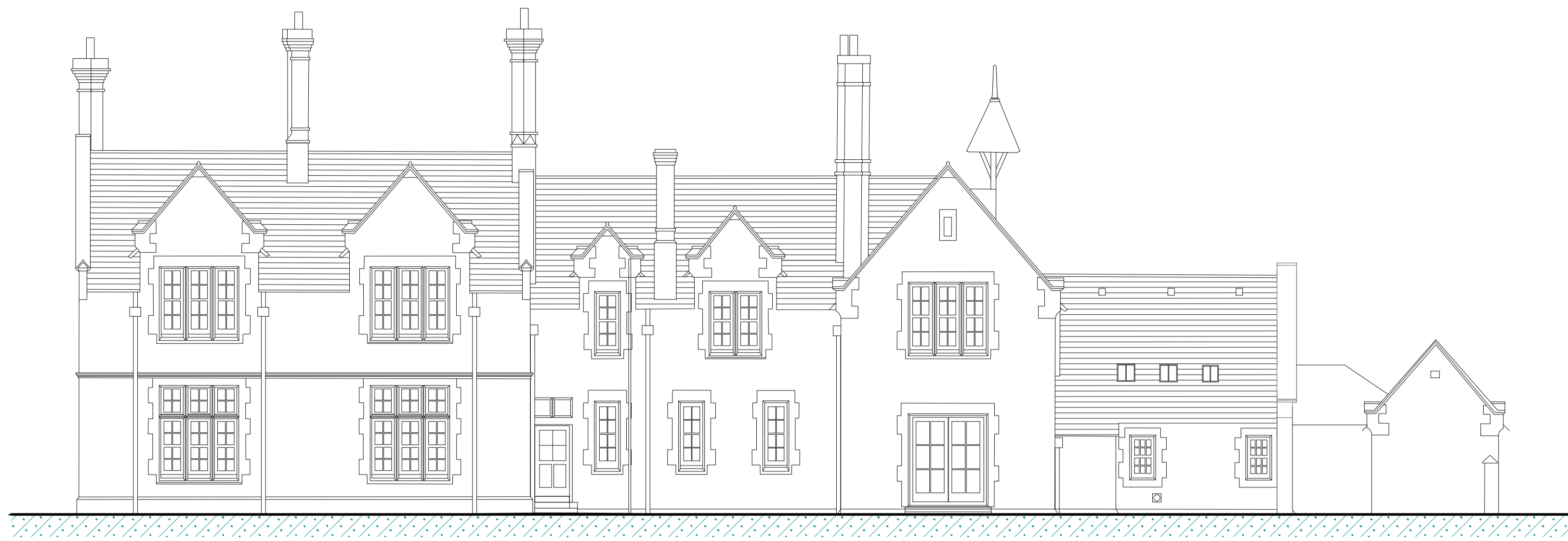
Existing Rear Elevation (South East) 1 : 100

NOTES The copyright of this drawing and design is from TMM and must not be copied or reproduced without written consent. All dimensions to be checked and verified on site via a responsible contractor prior to commencement of any works. This drawing to be read in conjunction with the specification and other drawings. Do not scale to ascertain dimensions.