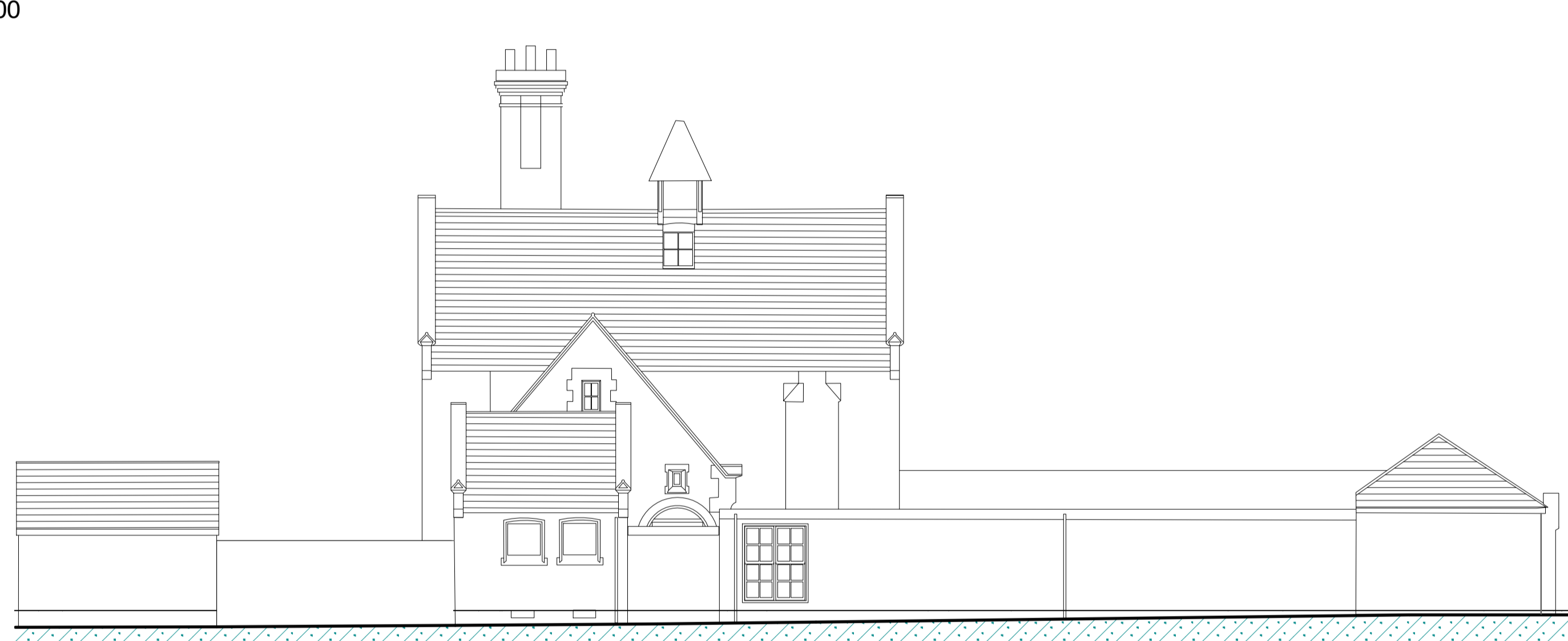
Existing Side Elevation from Coach House (North East) 1 : 100