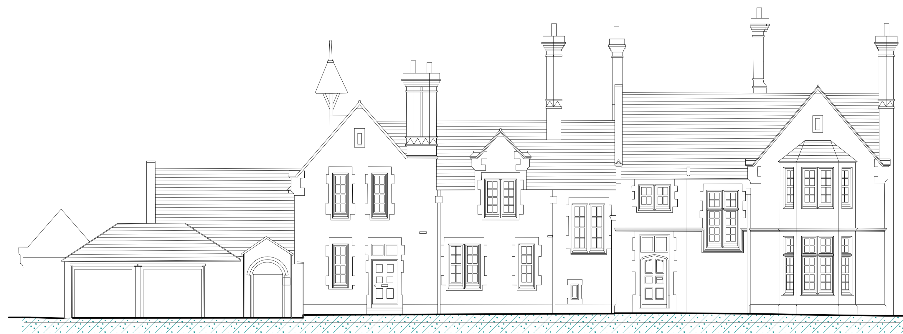
Existing Front Elevation from Driveway (North West) 1 : 100