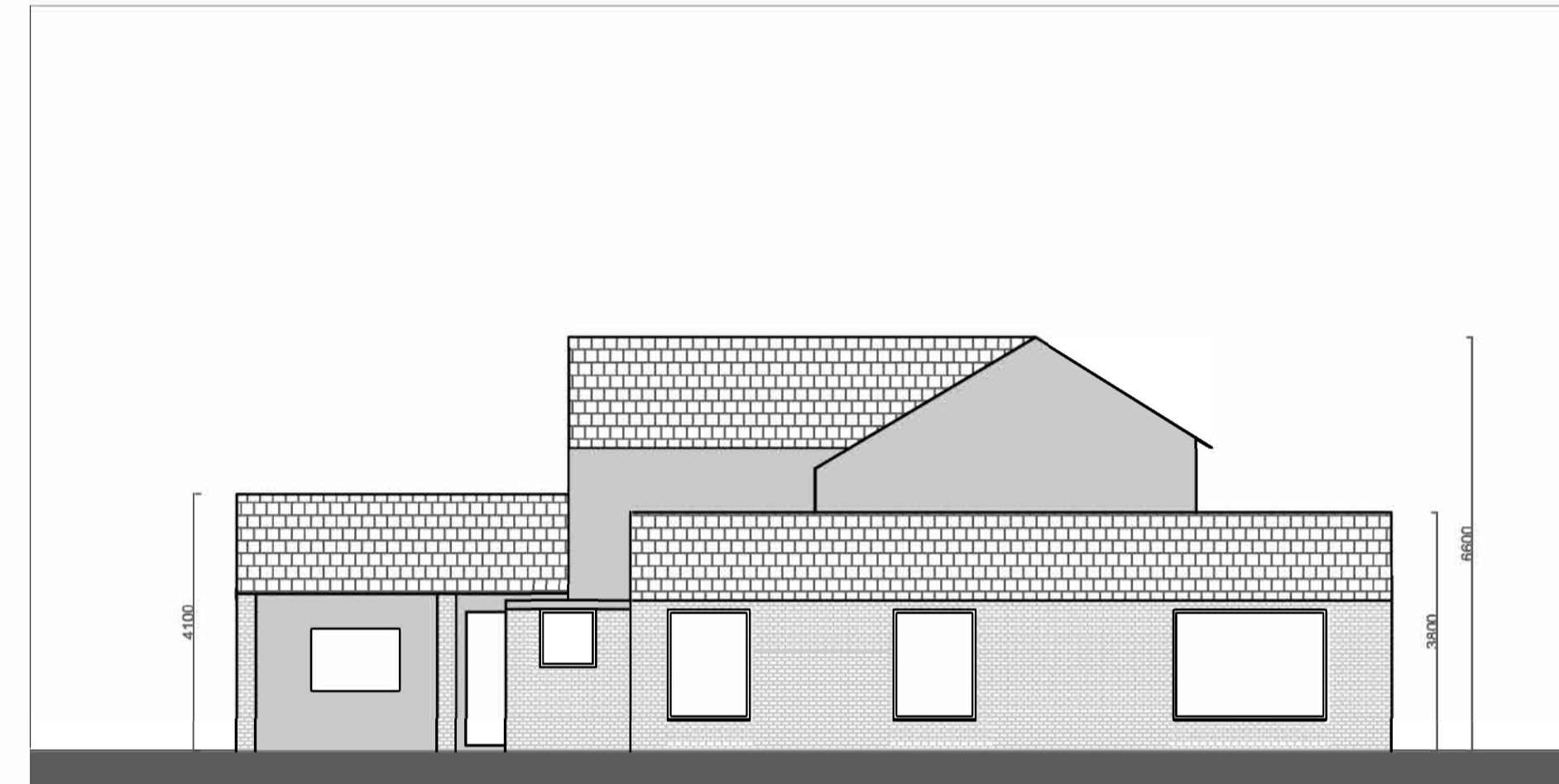
NORTH VIEW 1:100