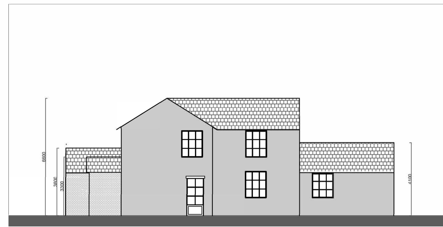
SOUTH VIEW 1:100