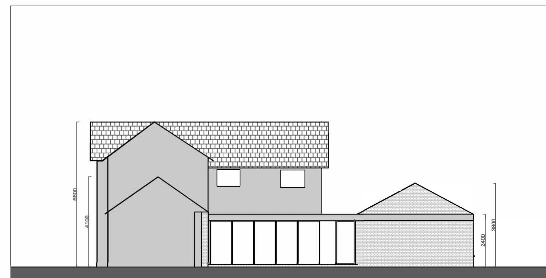
EAST VIEW 1:100