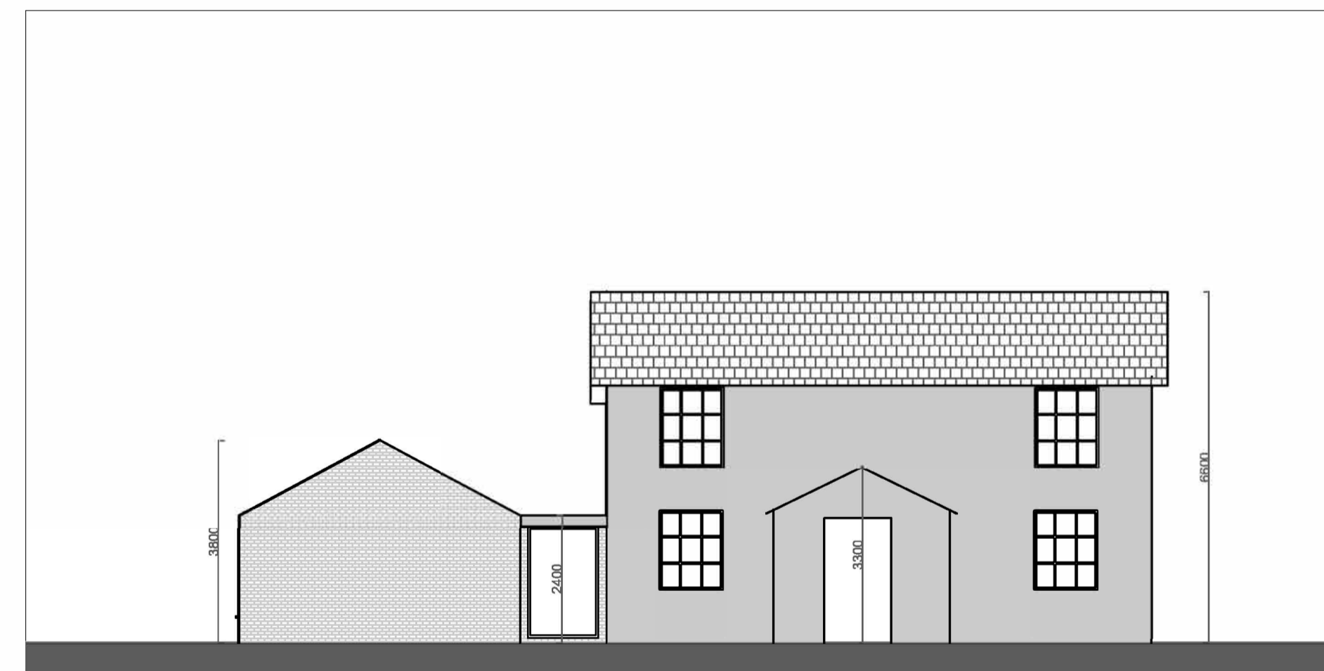
WEST VIEW 1:100