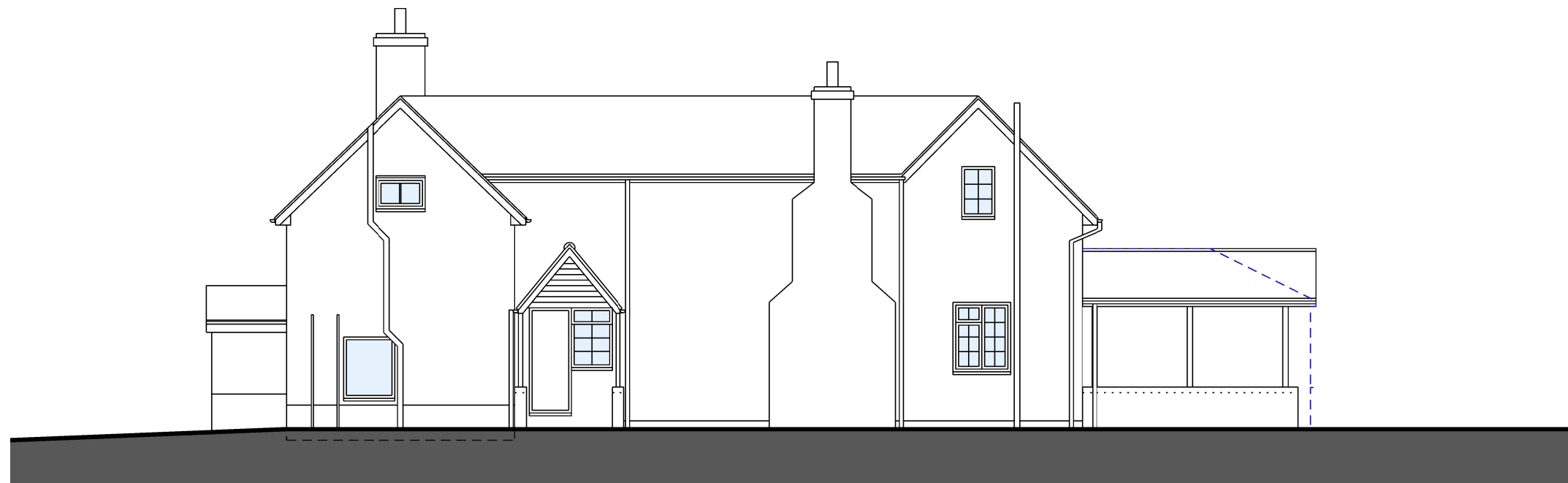
1 Side Elevation