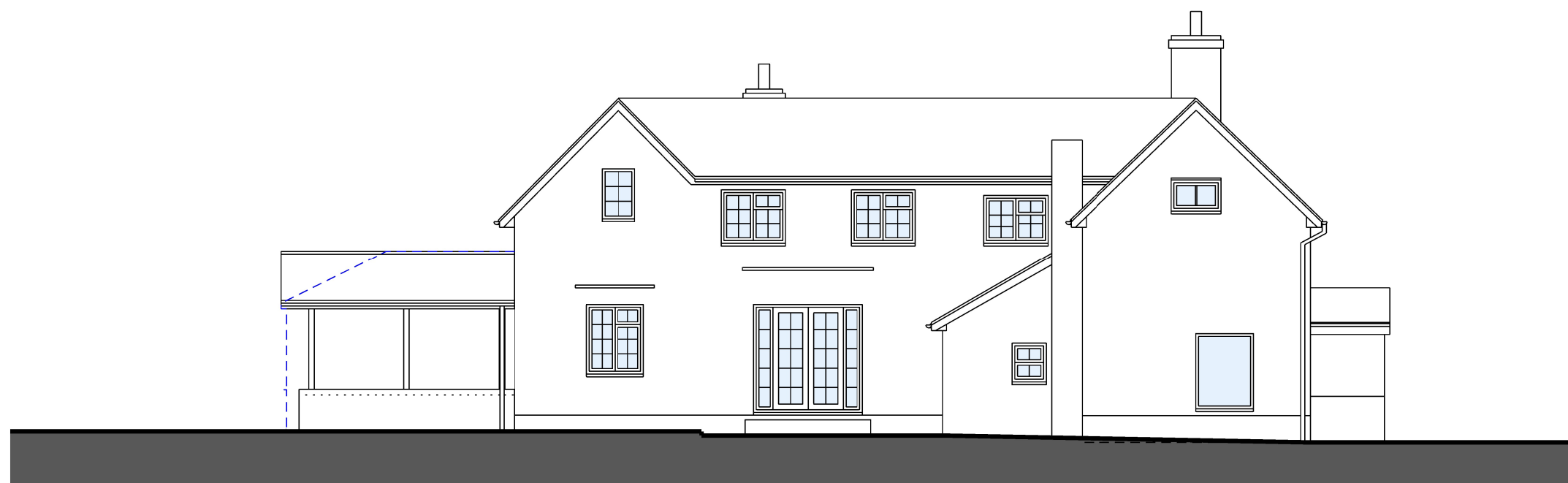
2 Side Elevation