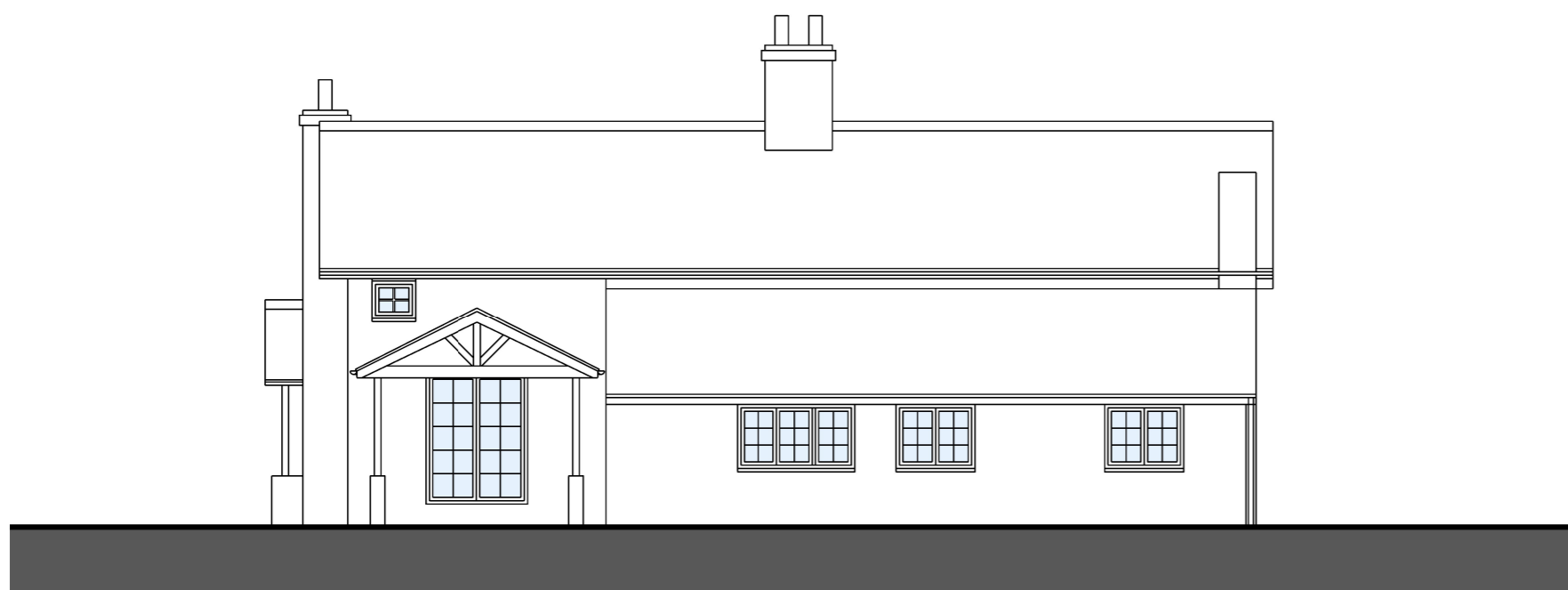
2 Rear Elevation