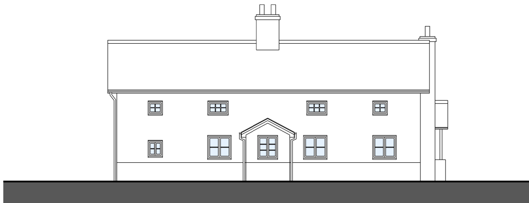
1 Front Elevation