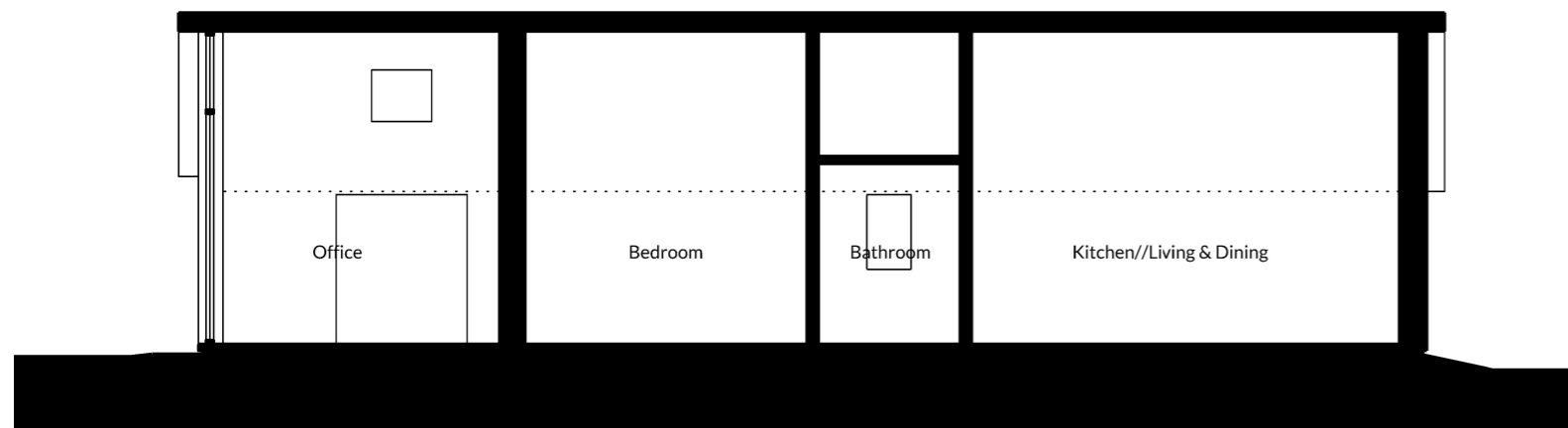
2 Granny Annexe & Office Section