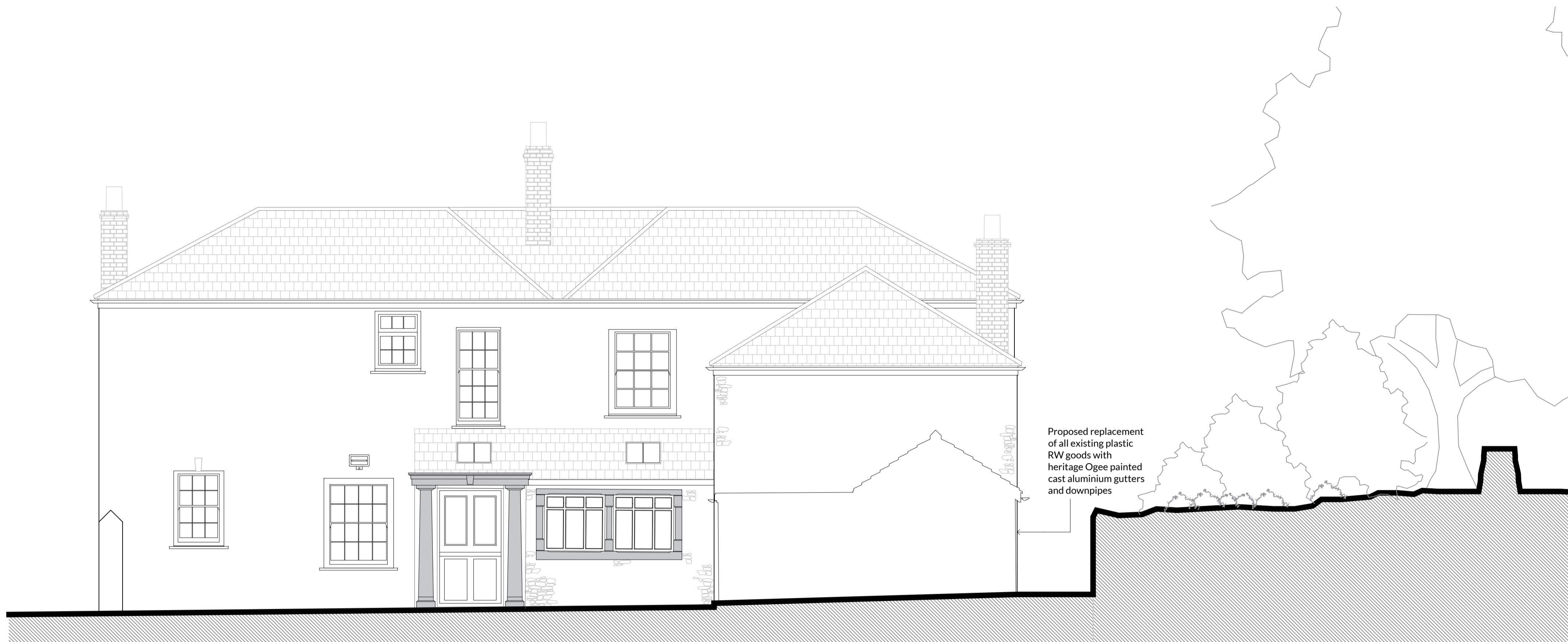
North Elevation - Section Profile (3) 1:50

RAINWATER GOODS: Painted cast aluminum ogee gutters with circular downpipes, traditional collars, jointed pieces and connections