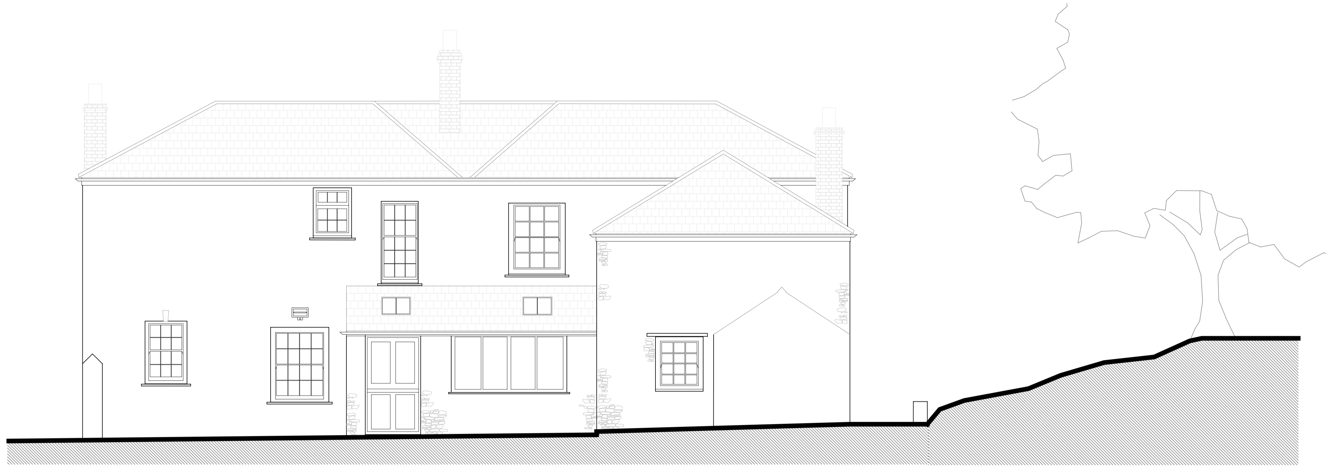
Existing North Elevation (3) 1:50

TBP NOTES THE DESIGNS AND LAYOUT IN THE DRAWING ARE COPYRIGHT OF TBP AND MAY NOT BE USED, AMENDED, COPIED OR REPRODUCED IN PART OR FULL FOR ANY PURPOSE FROM ANY SOURCE WITHOUT THE EXPRESS WRITTEN APPROVAL OF TBP. THE DRAWING IS TO BE USED SOLELY FOR THE INTENDED PURPOSE. THE ARCHITECT ACCEPTS NO LIABILITY & RESPONSIBILITY FOR ANY ERRORS OR OMISSIONS ARISING THROUGH MISUSE. THE DRAWINGS ARE NOT TO BE USED FOR ANY THIRD PARTY AGREEMENTS / CONTRACTS WITHOUT EXPRESS CONSENT OF THE ARCHITECT. CONTRACTORS MUST CHECK ALL DIMENSIONS ON SITE. ONLY FIGURED DIMENSIONS ARE TO BE WORKED FROM. TAKE SITE DIMENSIONS FOR ALL FABRICATION WORK. REFER ALL DISCREPANCIES AND REQUIREMENTS FOR ADDITIONAL INFORMATION TO THE ARCHITECT FOR CLARIFICATION OR INSTRUCTION BEFORE PUTTING WORK IN HAND.