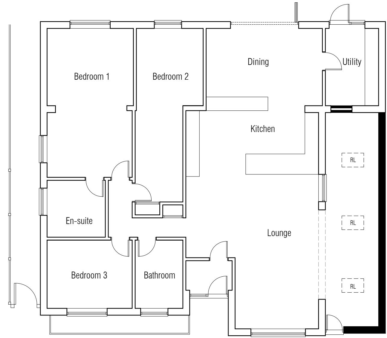
GROUND FLOOR PLAN - proposed

Velux rooflights Fibre cement horizontal boarding