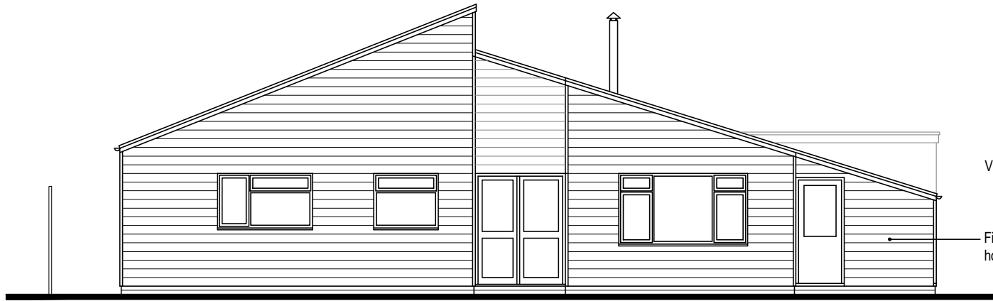
FRONT ELEVATION- proposed