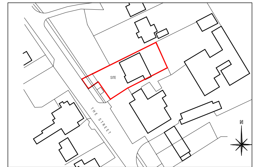
LOCATION PLAN - scale 1:1250