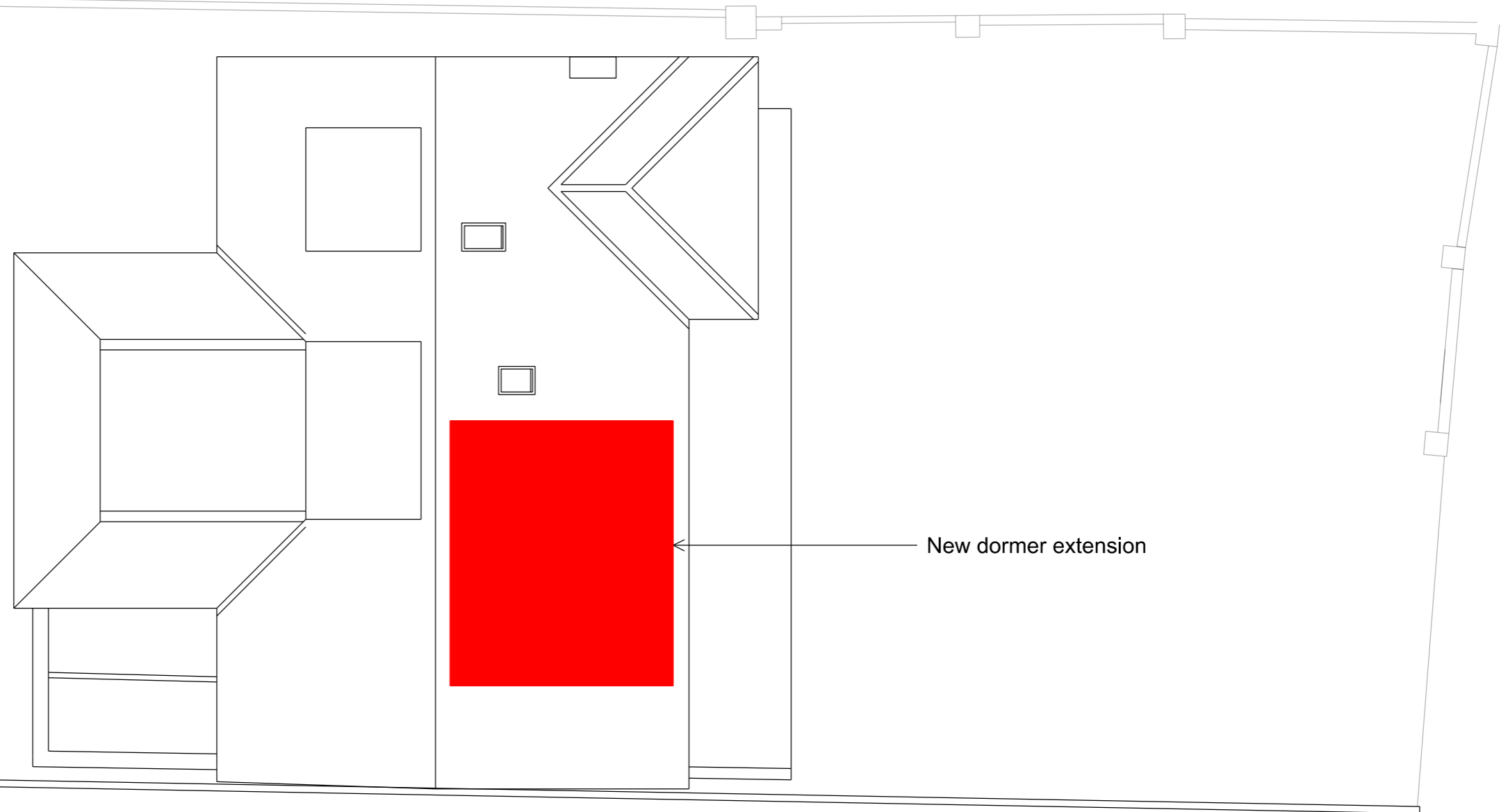
Proposed Roof Plan