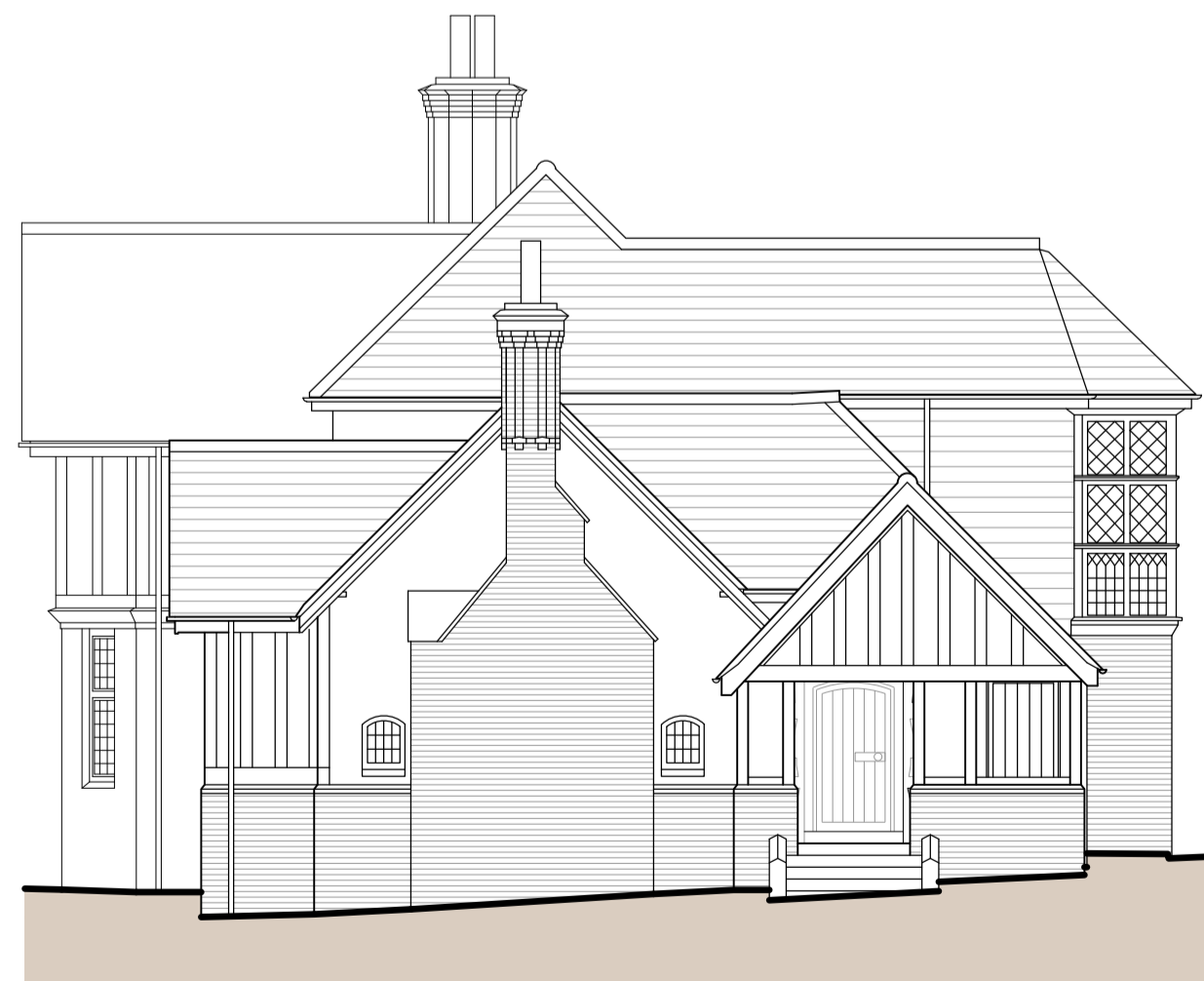
SIDE EAST ELEVATION