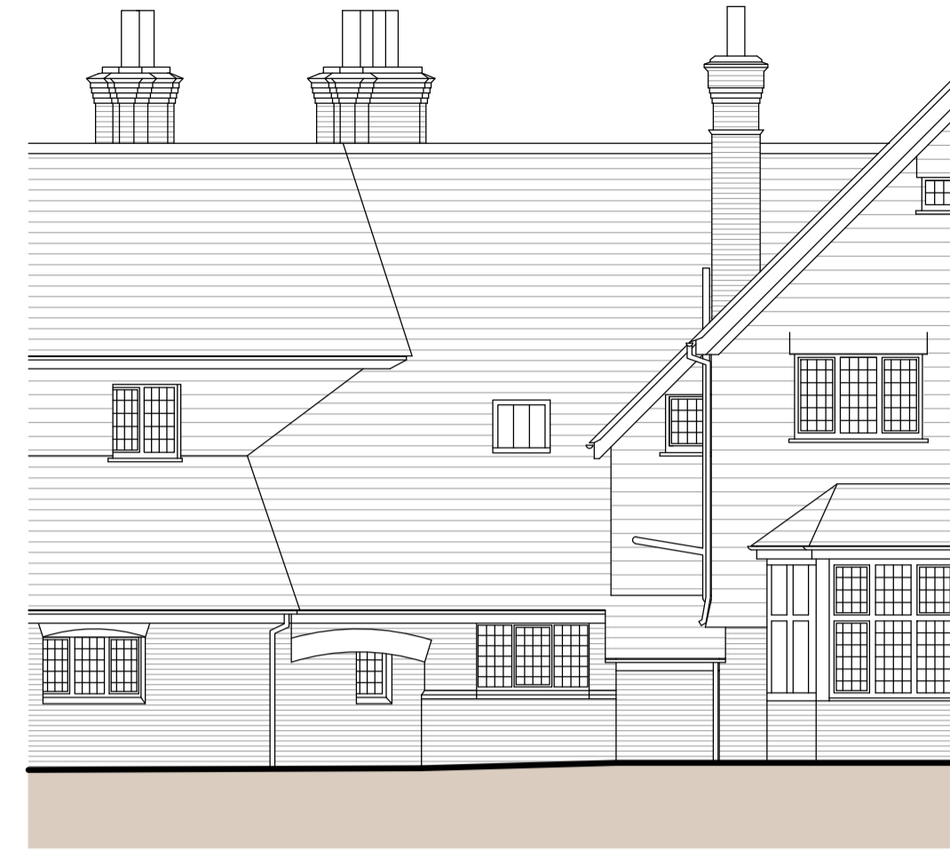
FRONT NORTH ELEVATION - SKEWED PLANE