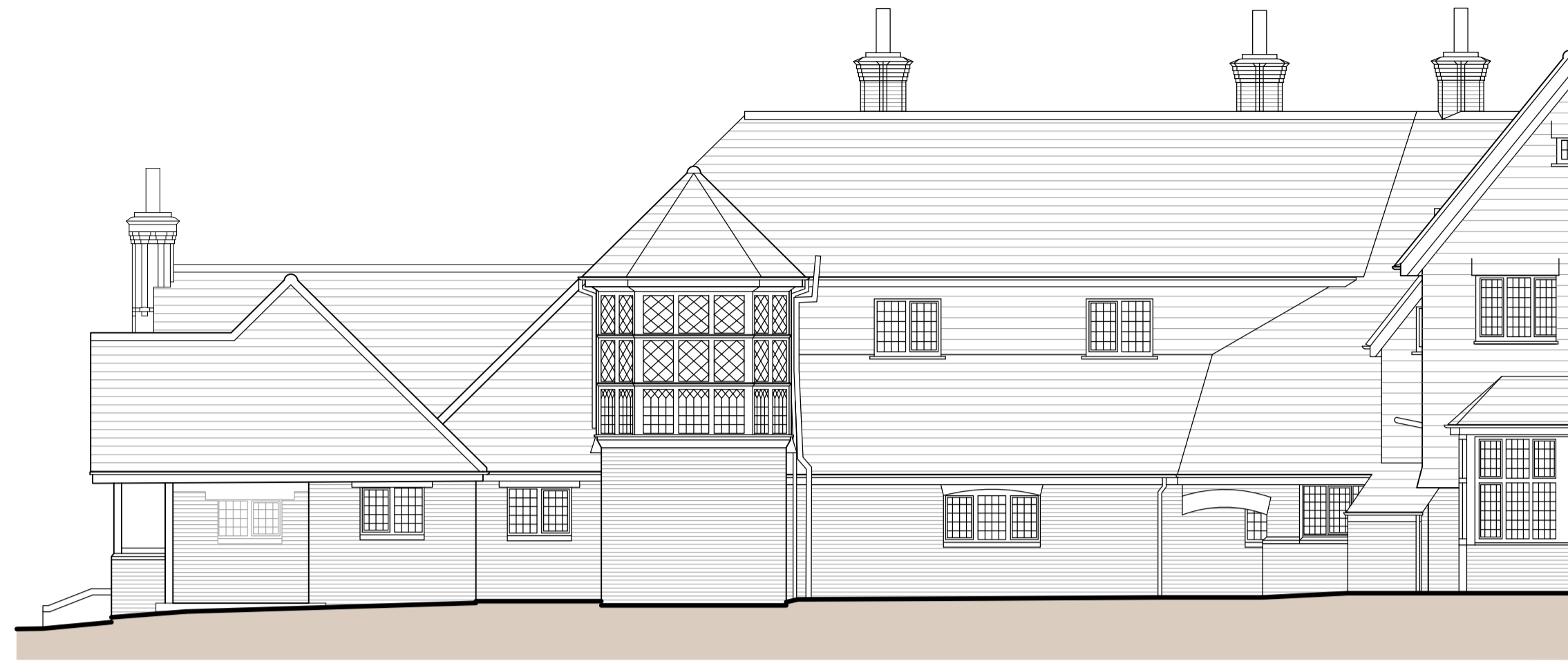
FRONT NORTH ELEVATION