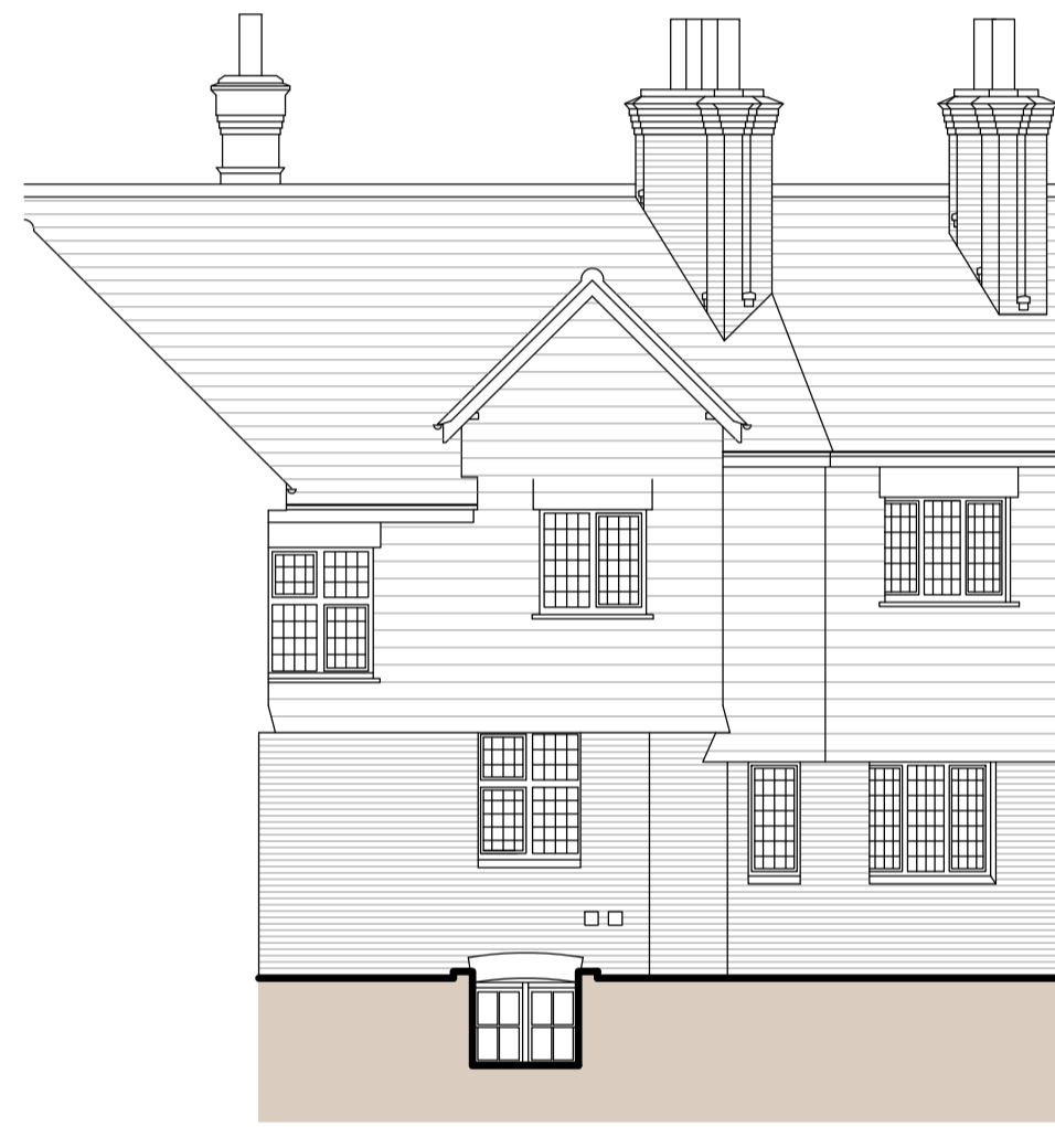
REAR SOUTH ELEVATION - SKEWED PLANE