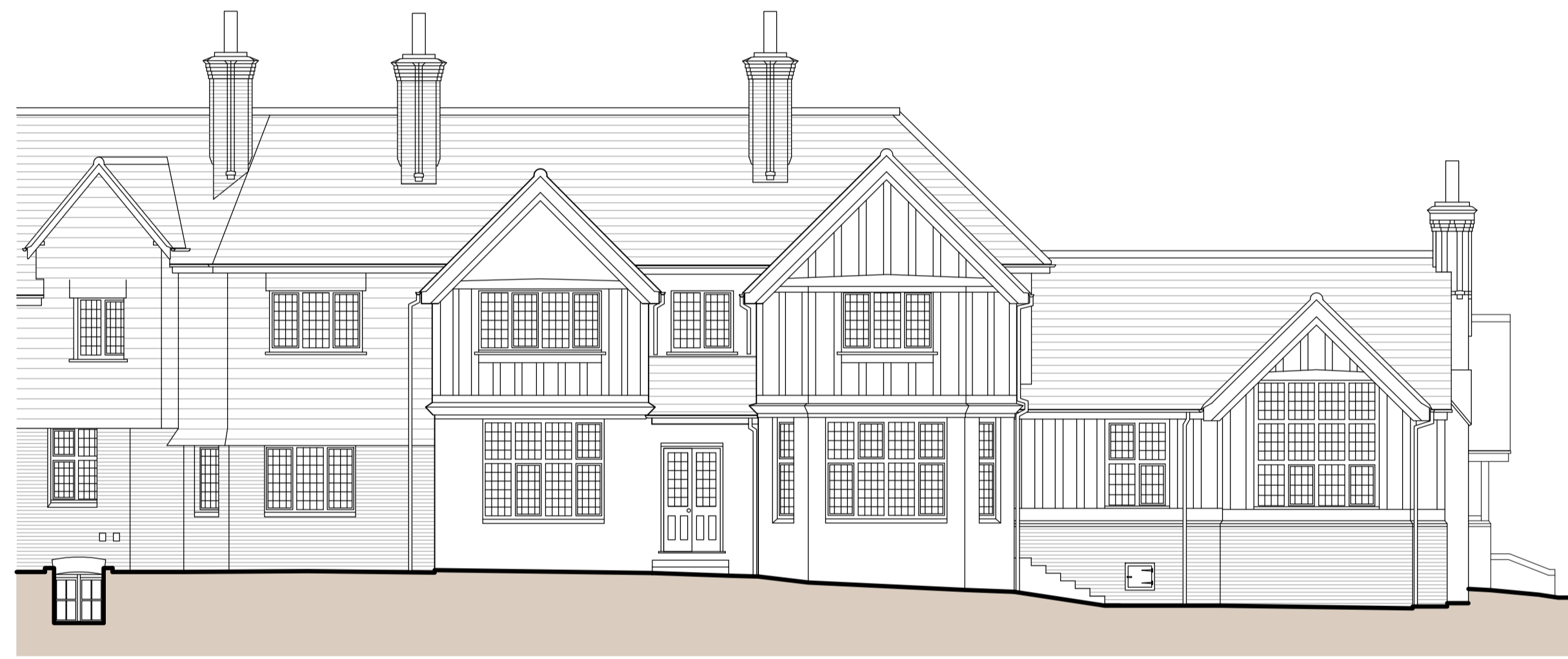
REAR SOUTH ELEVATION