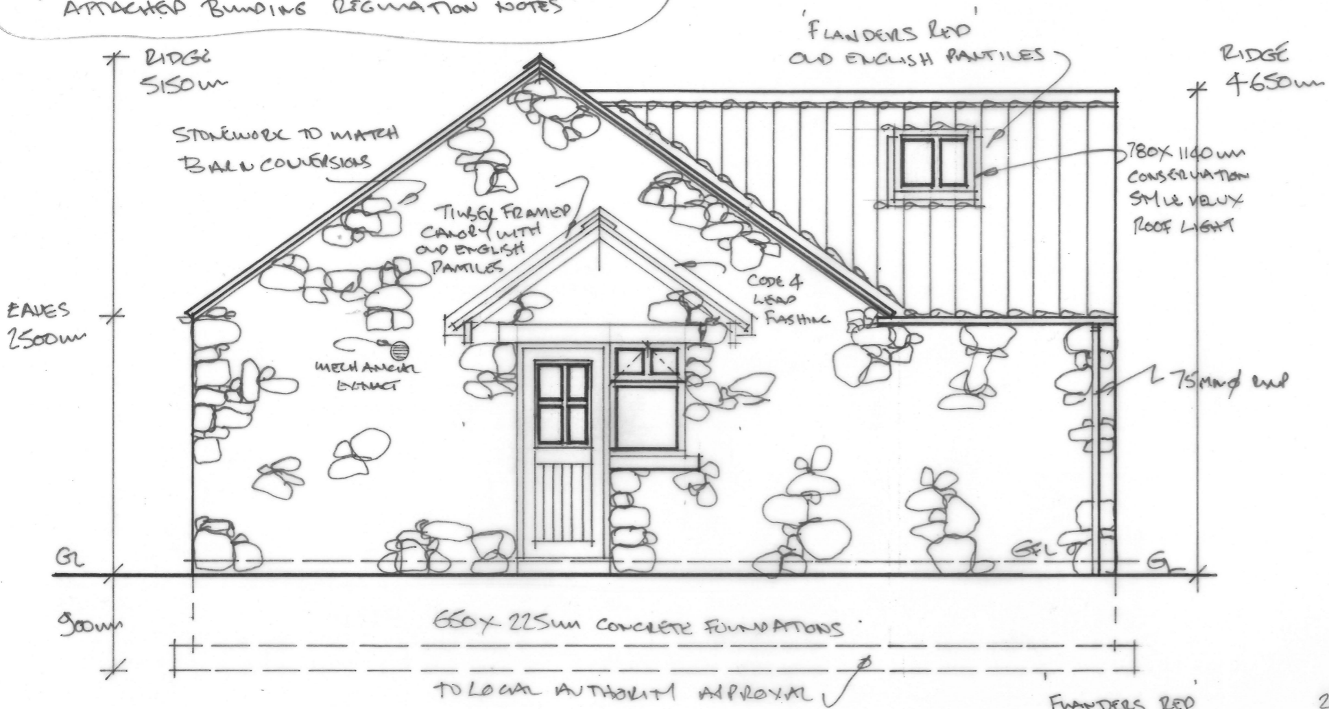
PROPOSED GABLE ELEVATION 1.50 (WEST)

1/2 DRAWINGS TO BE READ IN CONJUNCTION WITH ATTACHED BUILDING REGULATION NOTES