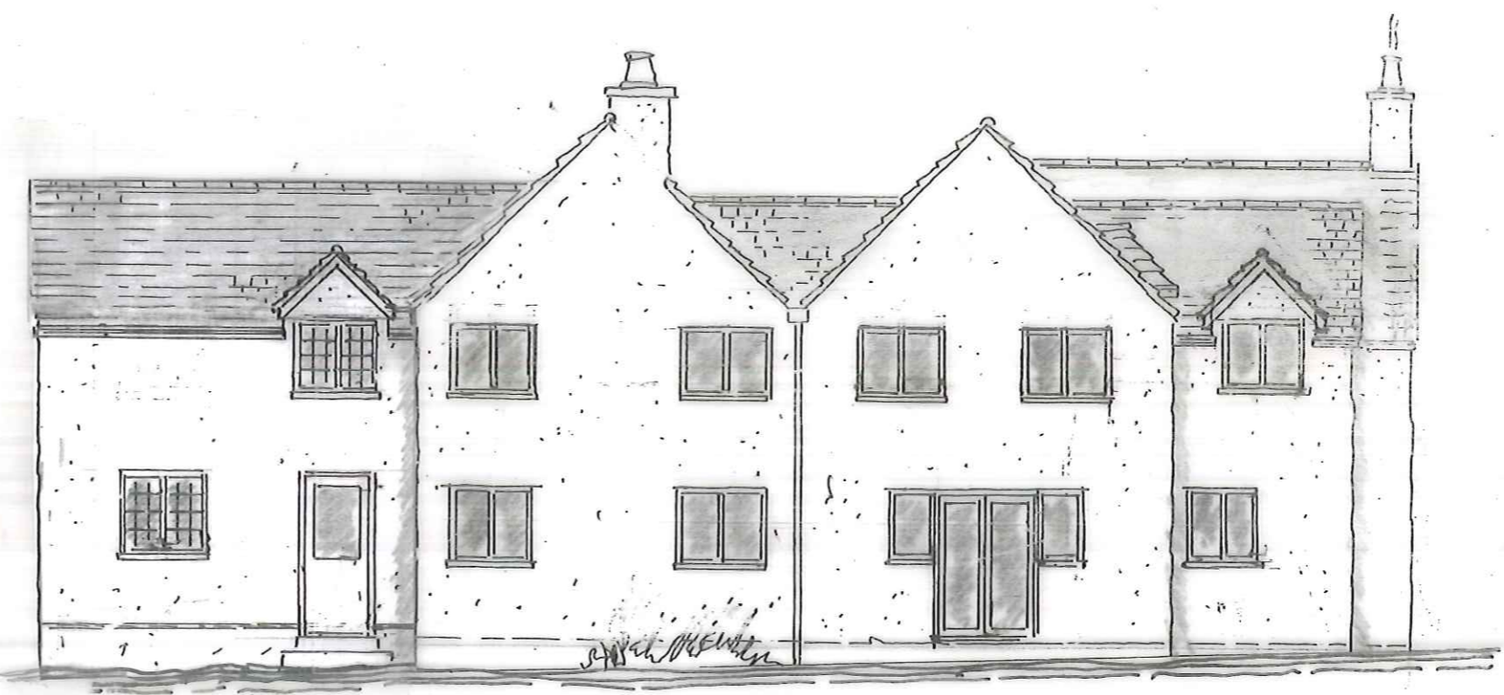
EXISTING NORTH WEST ELEVATION