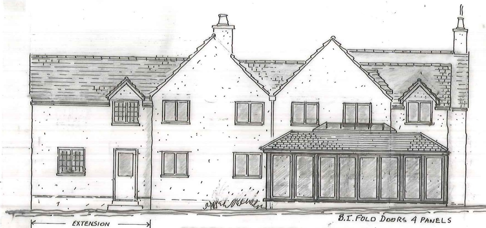
PROPOSED NORTH WEST ELEVATION