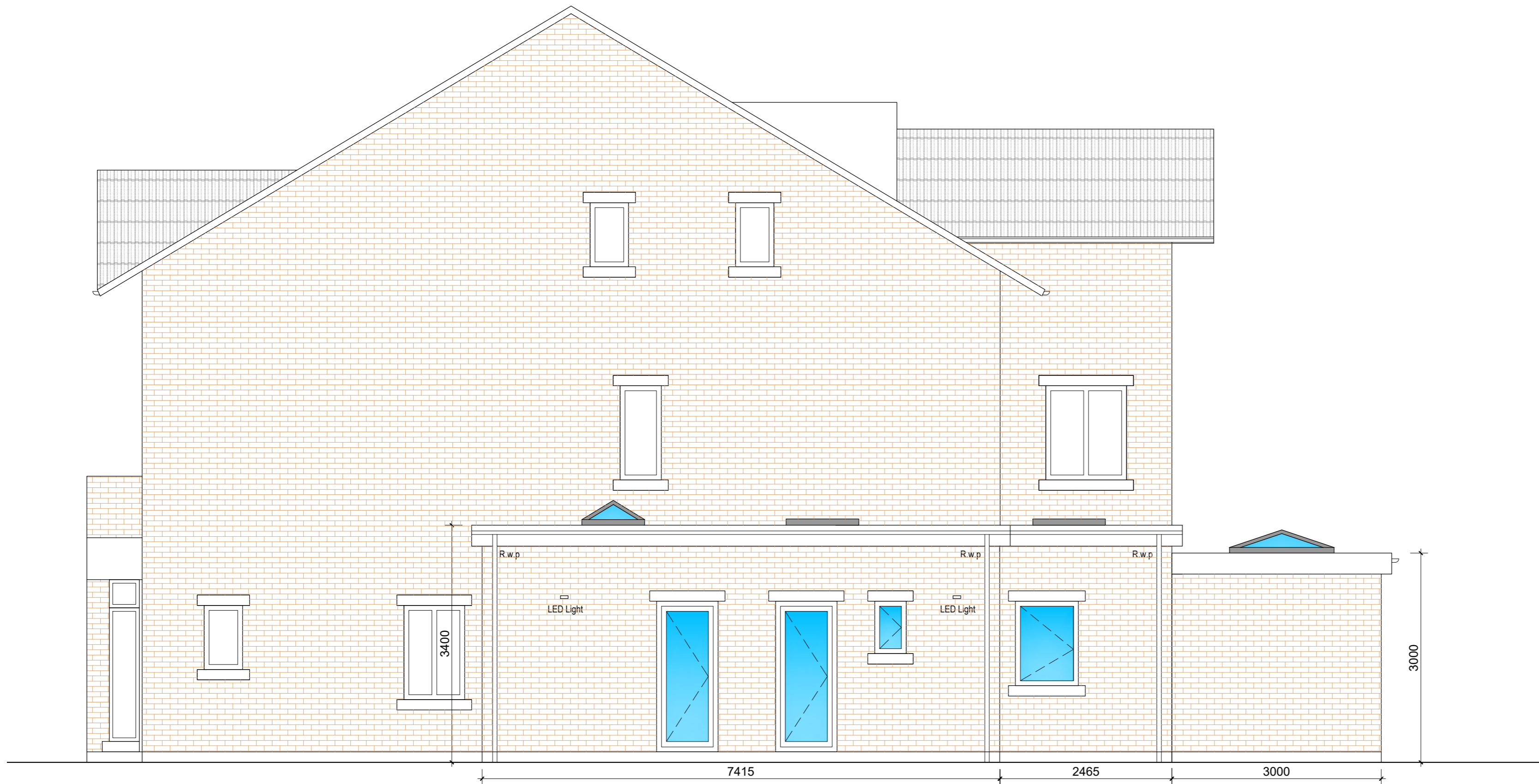
PROPOSED SIDE ELEVATION LOOKING SOUTH Scale 1:50