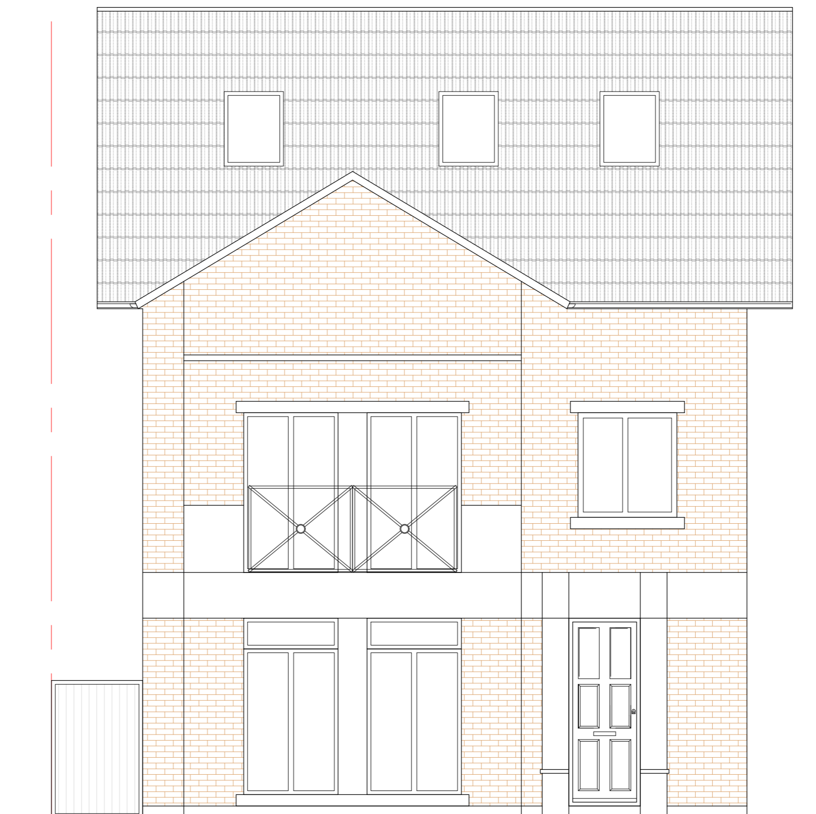
EXISTING FRONT ELEVATION LOOKING WEST Scale 1:50