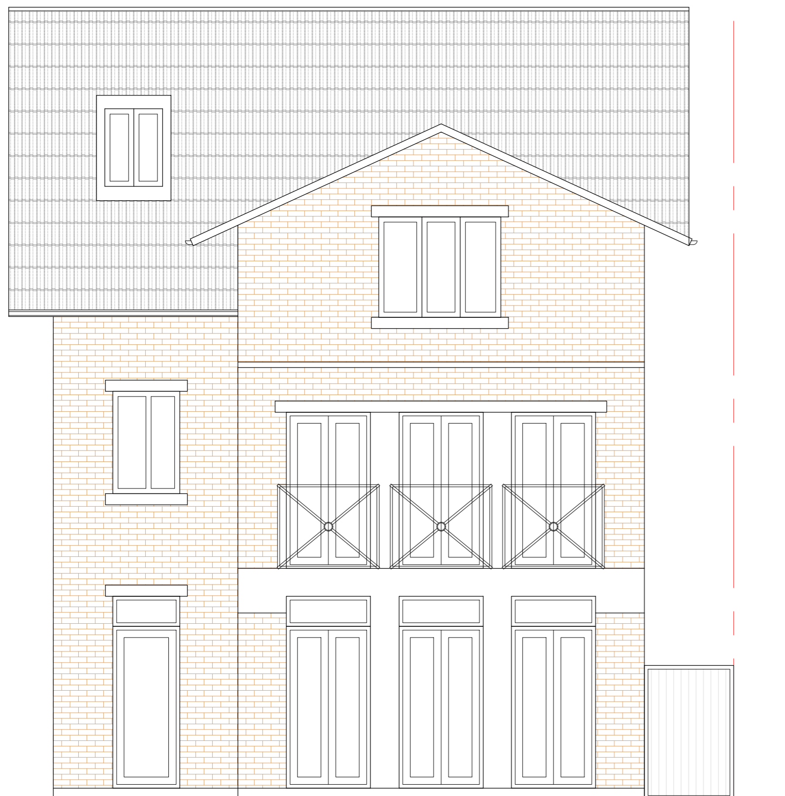
EXISTING REAR ELEVATION LOOKING EAST Scale 1:50