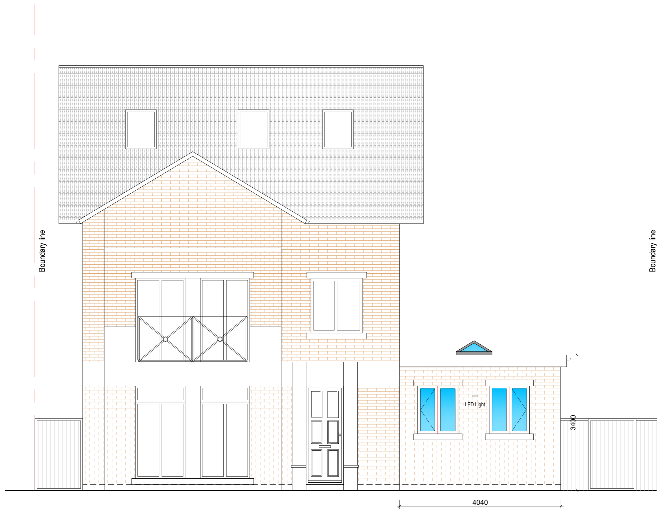
PROPOSED FRONT ELEVATION LOOKING WEST Scale 1:50