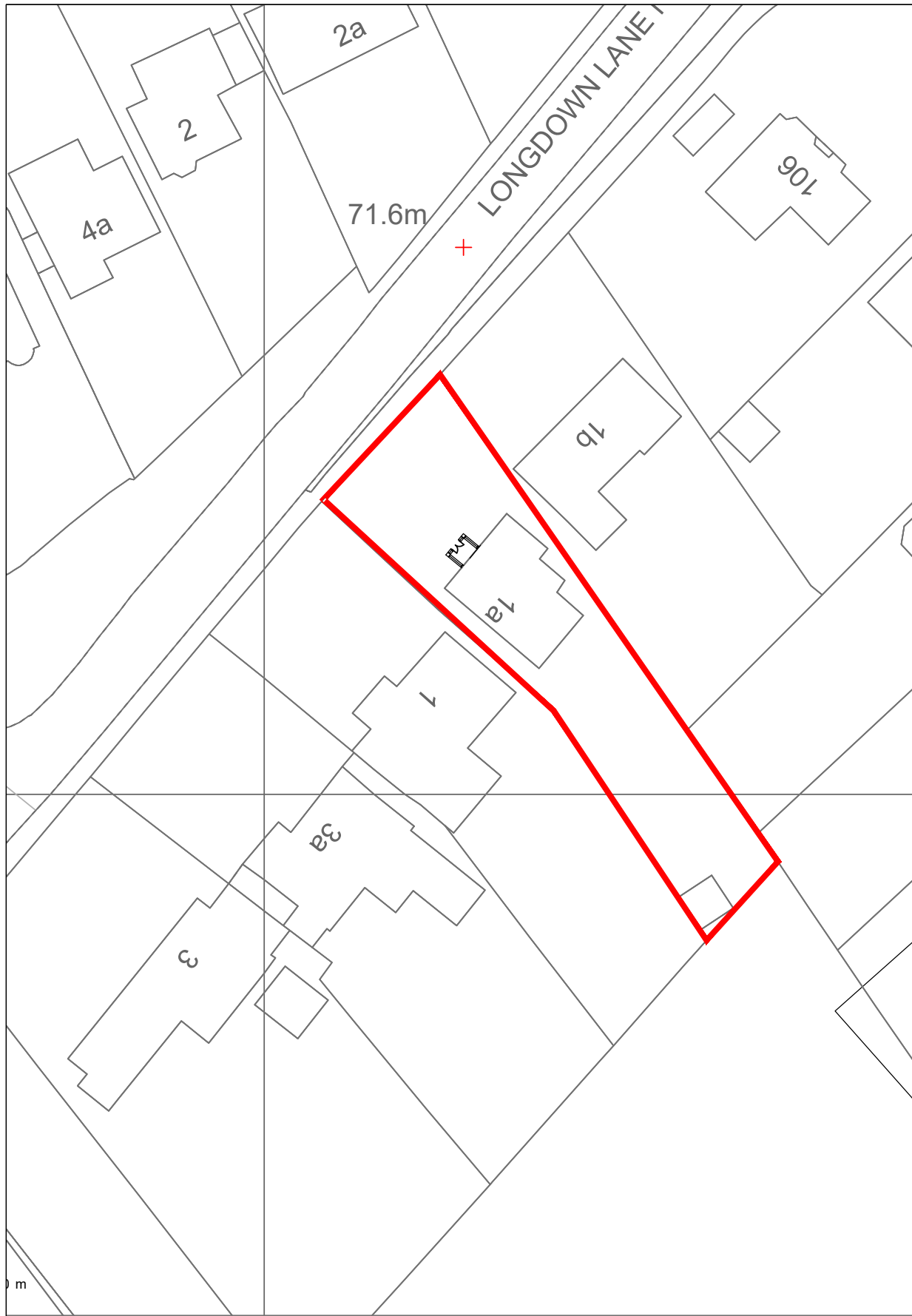
522500 Site Plan Scale 1:500