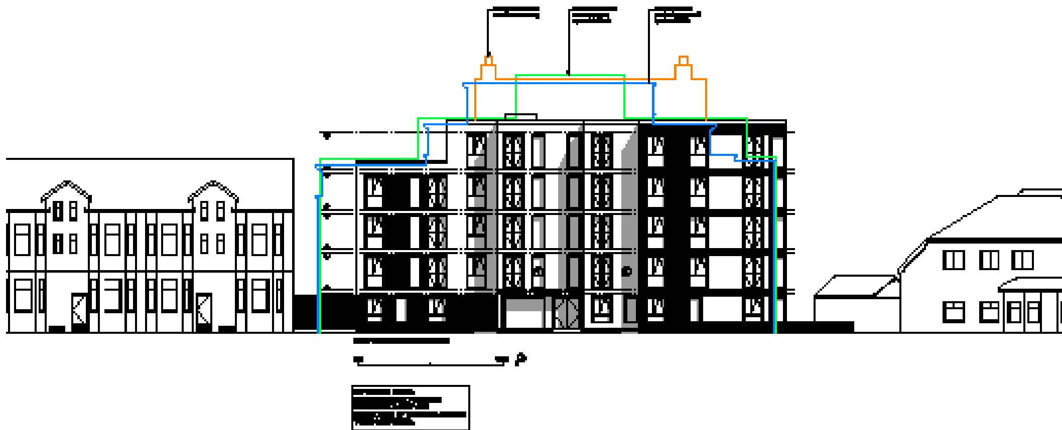
Proposed North Elevation with previous schemes outlined