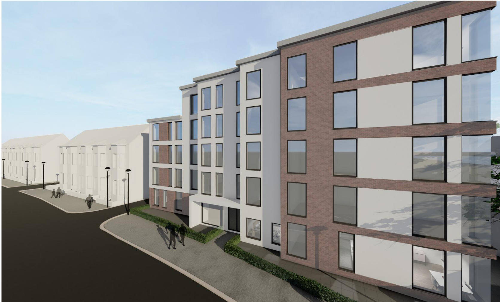
CGI Image of Proposed Development