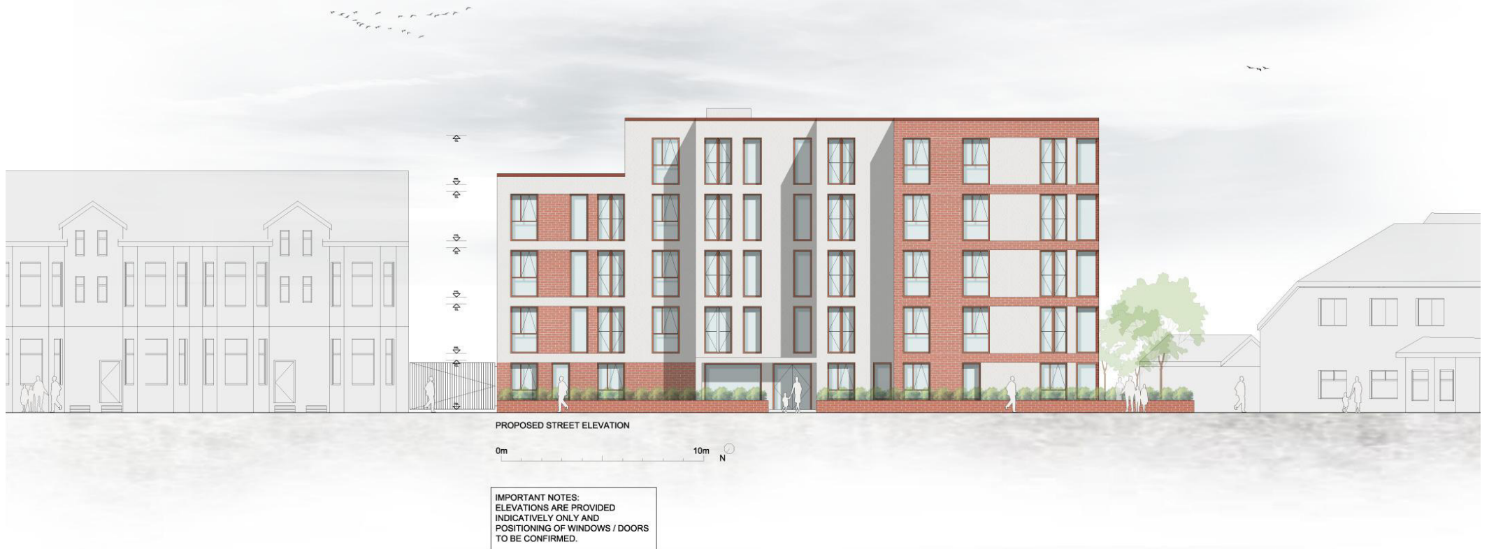
Proposed Street Scene Elevation