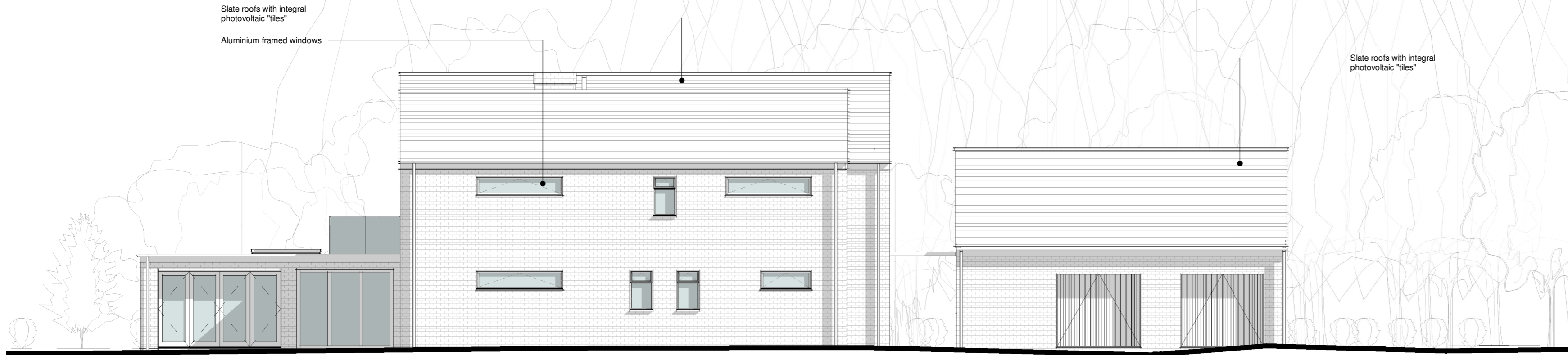
South-West Elevation 1 : 100