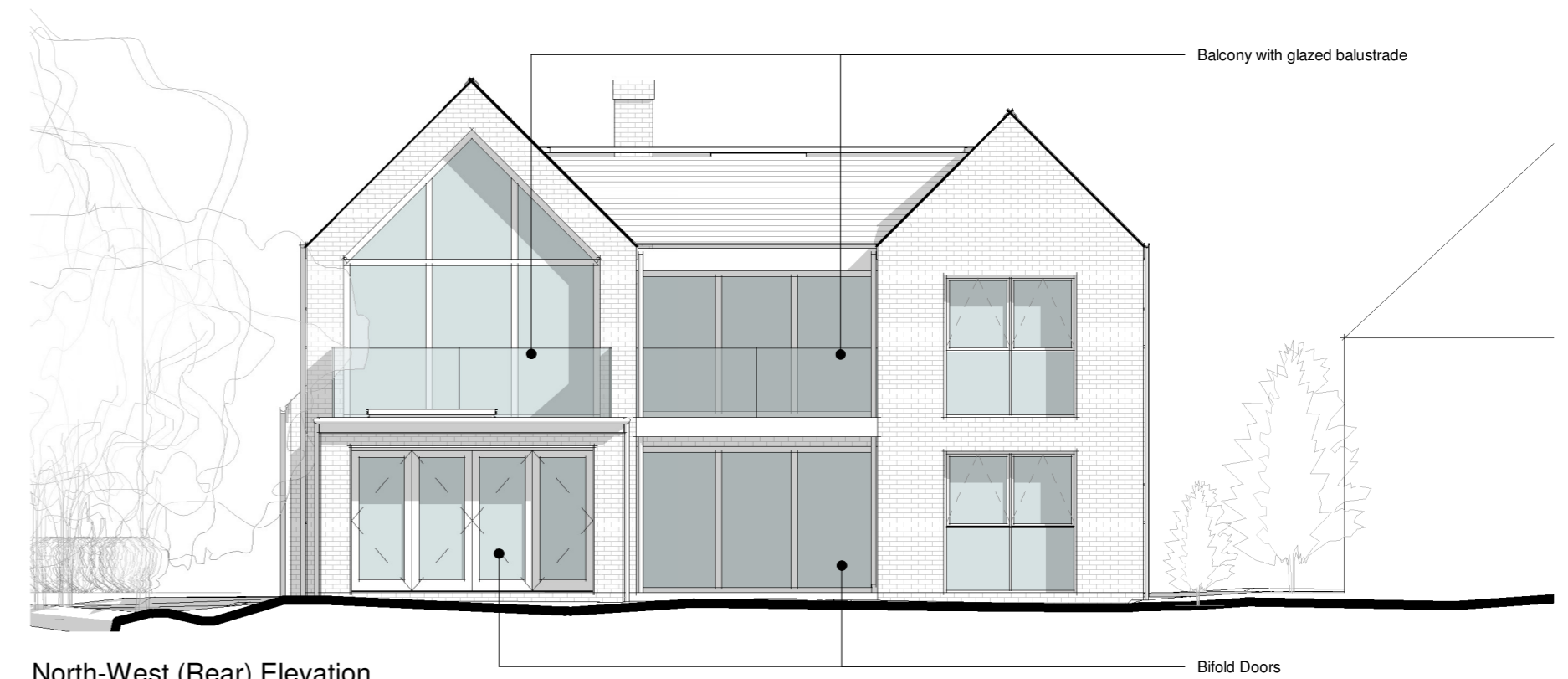
North-West (Rear) Elevation 1 : 100