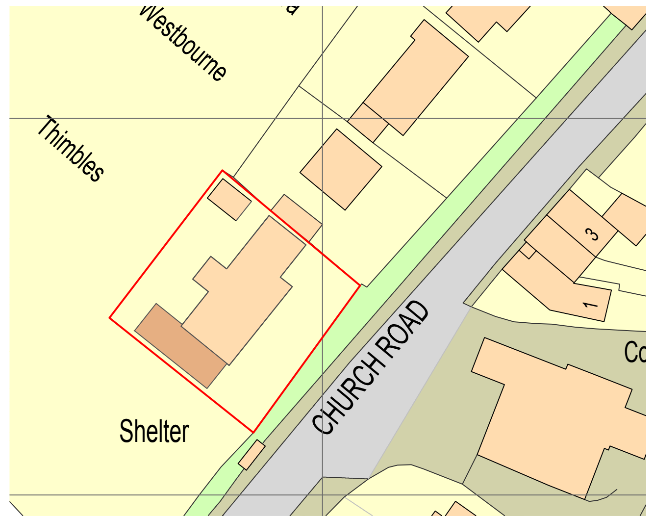
PROPOSED BLOCK PLAN 1:500