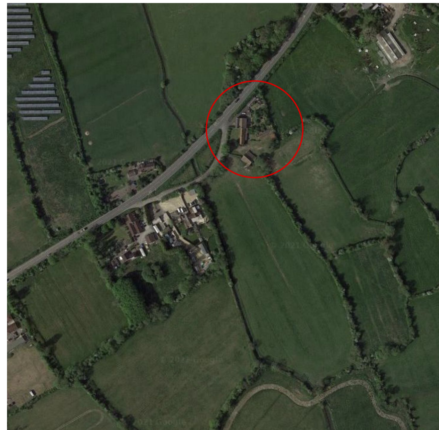
8 Satellite View