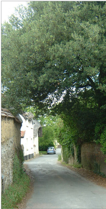
Protected trees within a conservation area

You do not need to give notice if you want to work on trees smaller than 75mm in diameter.