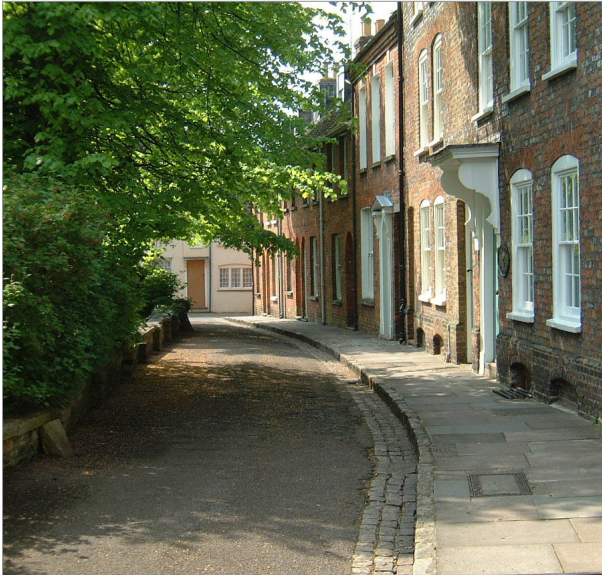
Historic residential area