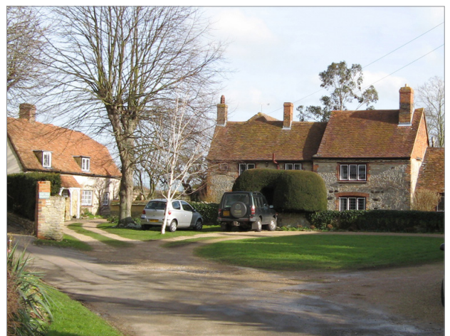
A green space enclosed by buildings of domestic scale and traditional appearance

considering undertaking repairs or alterations to their properties. Small incremental changes to properties such as the replacement of original windows or doors or the use of inappropriate building materials can have a cumulative effect upon the character and appearance of individual buildings and upon the area as a whole. Equally, poorly conceived new development or insensitive extensions to older properties can detract from the character of a Conservation Area.