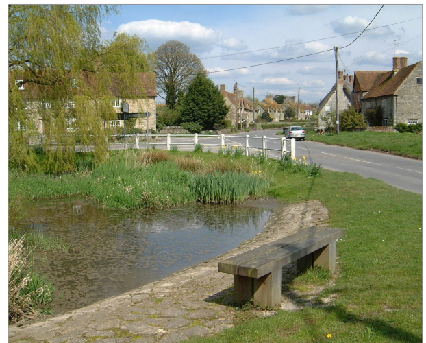
Historic village scene

Please contact the Tree Officers in Leisure Services for advice and guidance relating to trees within the District on 01296 585368 or 01296 585586 or email trees@aylesburyvaledc.gov.uk