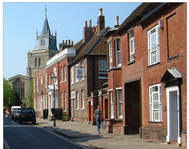
Historic urban street scene

The principal purpose of Conservation Area designation is the official acknowledgement of the special character of an area. This will influence the way in which the Local Planning Authority deals with planning applications which may affect the area. Within Conservation Areas, permitted development rights are restricted, which means that applications for planning permission will be required for certain types of work not normally needing consent.