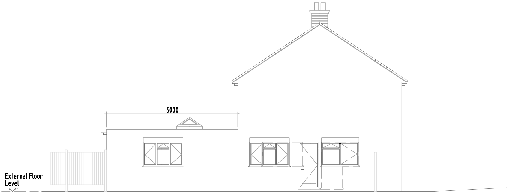
Proposed East Side Elevation