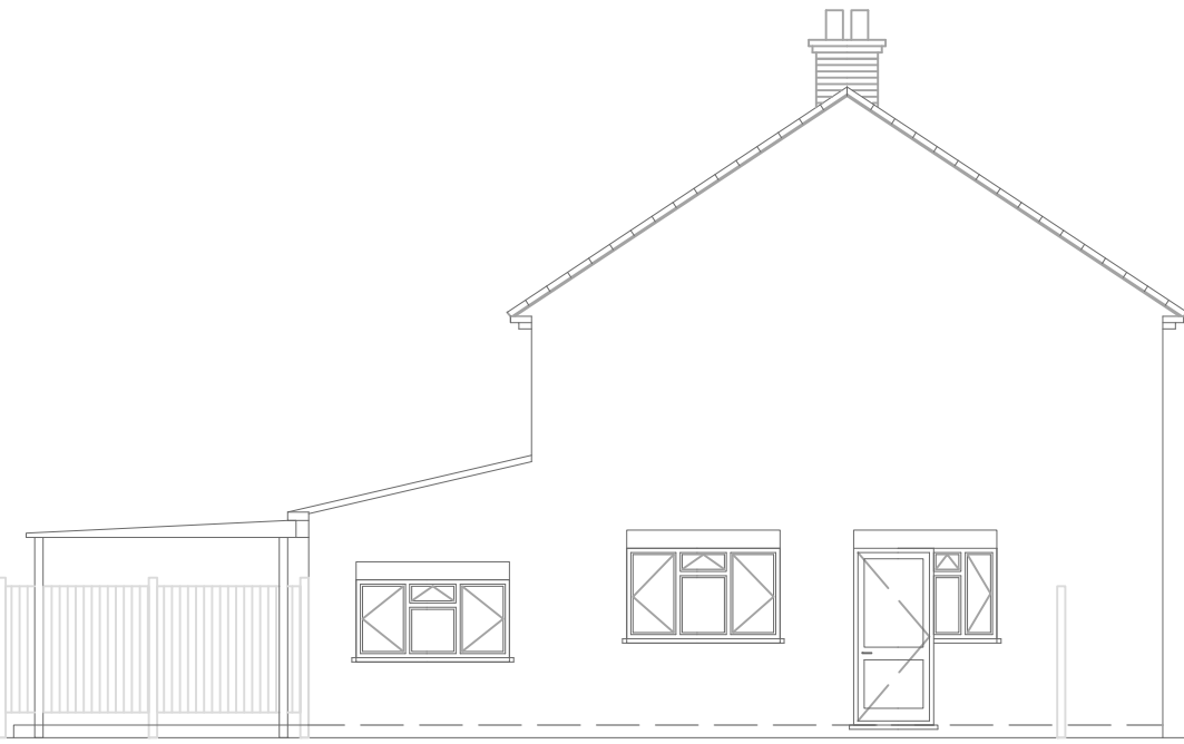
Existing East Side Elevation