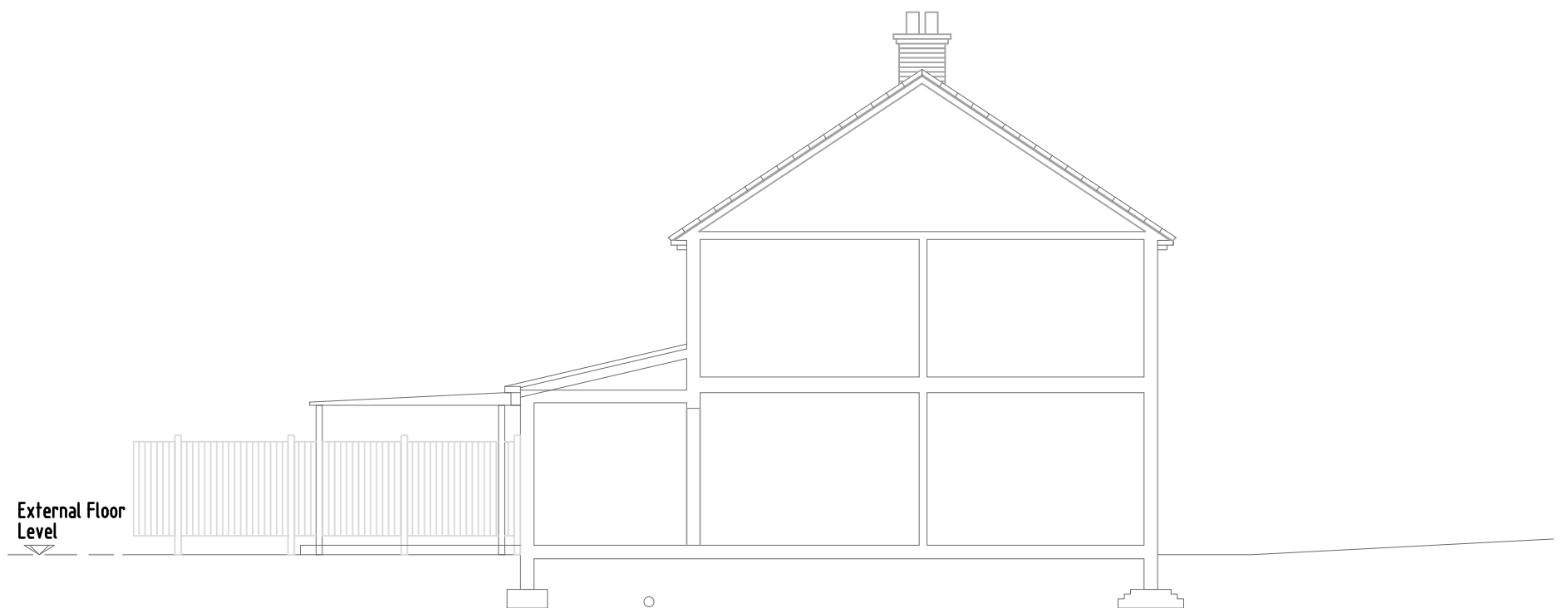
Existing Section A-A