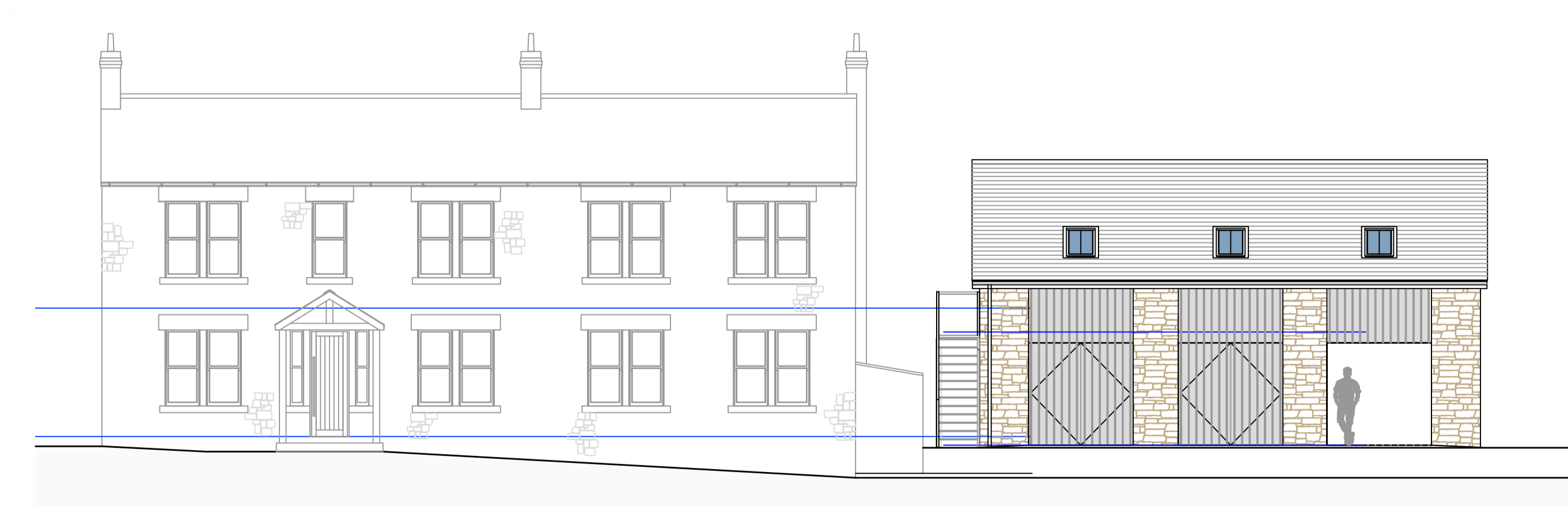
SITE WIDE ELEVATION (SOUTH) SCALE 1: 100

N.B - DO NOT SCALE FROM THESE DRAWINGS, IF IN DOUBT ASK - ALL DIMENSIONS ARE TO BE VERIFIED ON SITE BY THE CONTRACTOR AND ANY DISCREPANCIES REPORTED TO THE CLIENT/ ARCHITECT PRIOR TO CONSTRUCTION