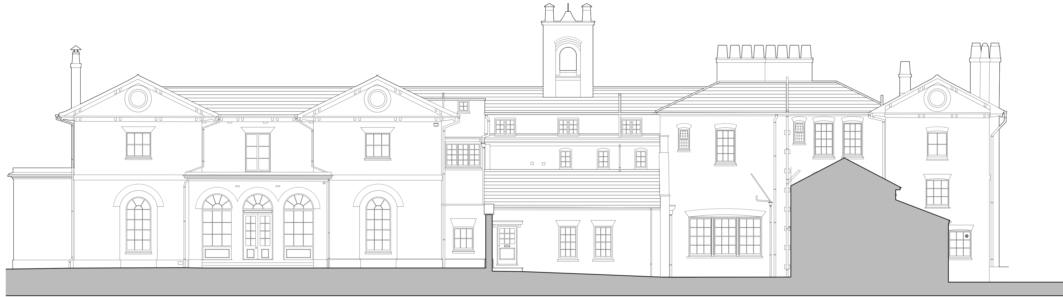
1 North West Elevation - Existing Scale: 1:100

1.12 Proposed Garden Room Existing bread oven and adjacent flag stone flooring is retained. Large format glazing with sliding doors to the proposed garden room. The proposed glazing line reflects the geometry of the bread oven and curves around the existing bread oven. The curved corner is set back from the main house which remains visually dominant.