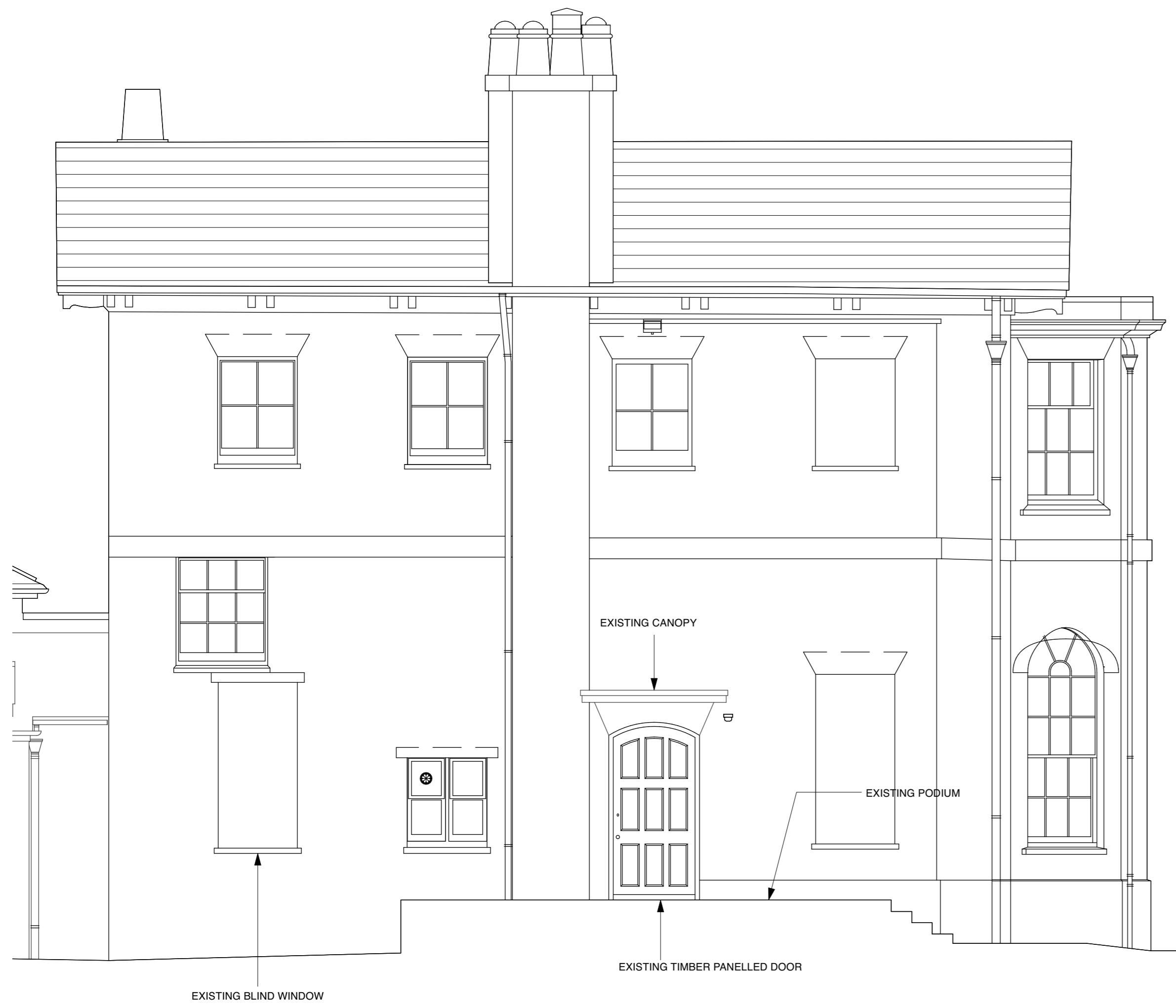
1 SOUTH WEST ELEVATION - EXISTING Scale: 1:50