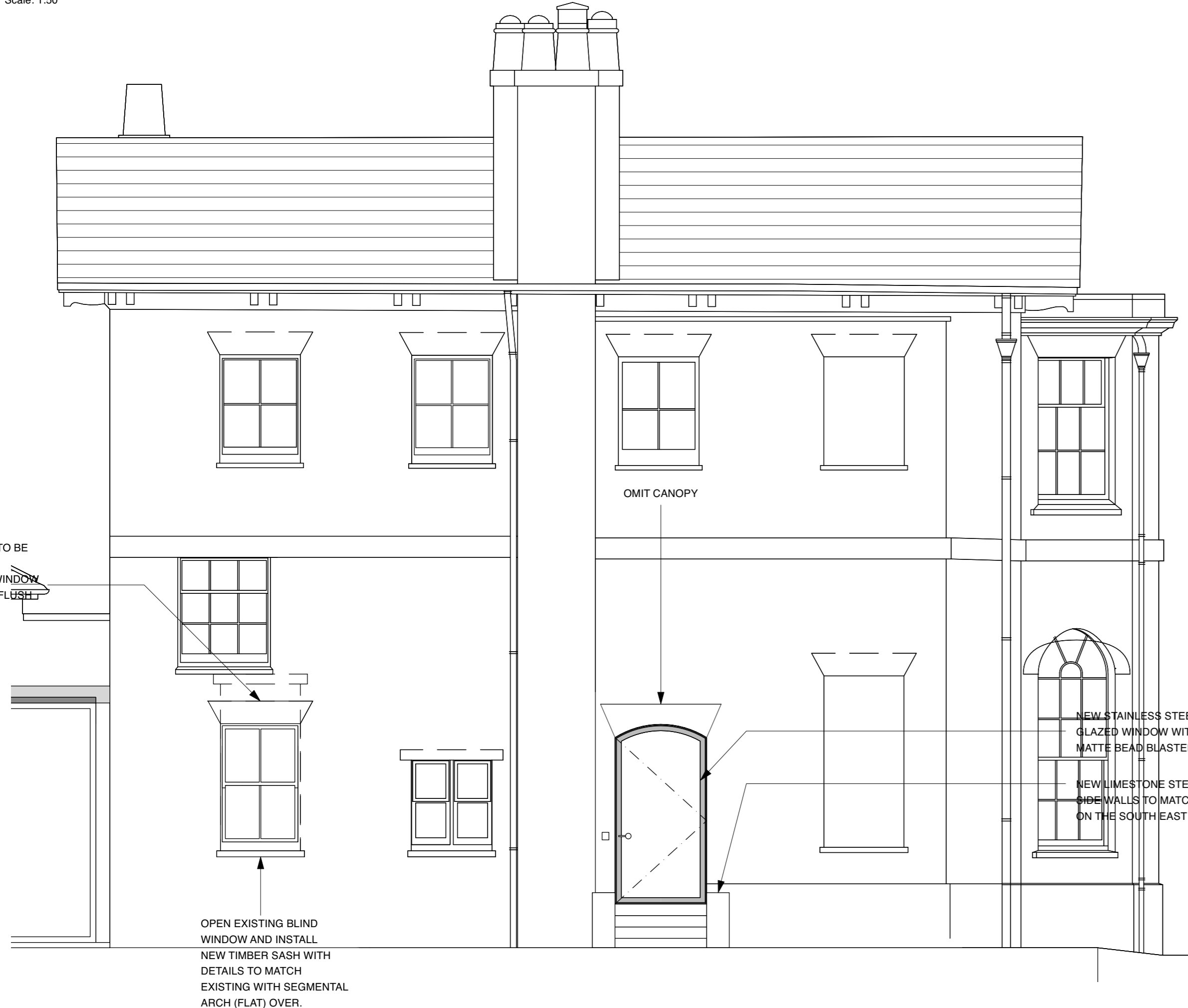
3 SOUTH WEST ELEVATION - PROPOSED