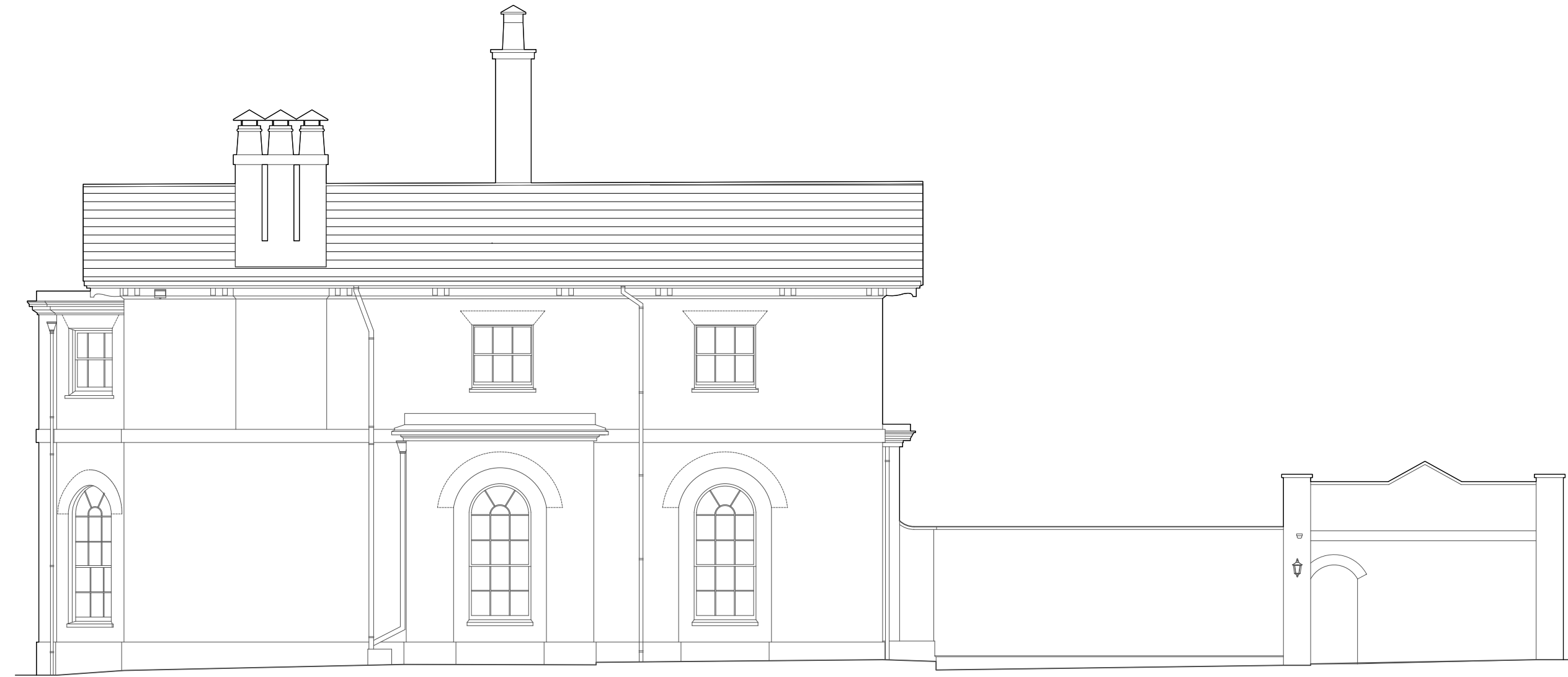
2 North East Elevation - Existing Scale: 1:100

1.02 Courtyard Wall New courtyard wall reconfigured to curve outwards brickwork and mortar to match that of existing nash house.