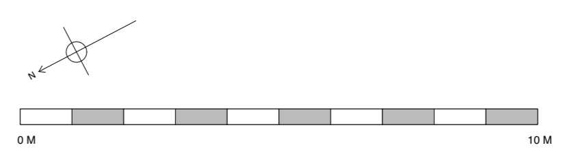
1 GROUND FLOOR - GENERAL ARRANGEMENT Scale: 1:100

JOB: 0151 TITLE: PROPOSED GROUND STATUS: PLANNING DATE: 17/12/21 SCALE: 1:100 (A1) DRAWN: ZT INSPECTED: BC REV: P1 NUMBER: 0151-P-100-02