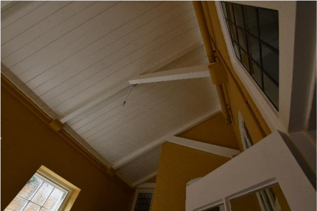
Image 5 Roof structure of Boot Room