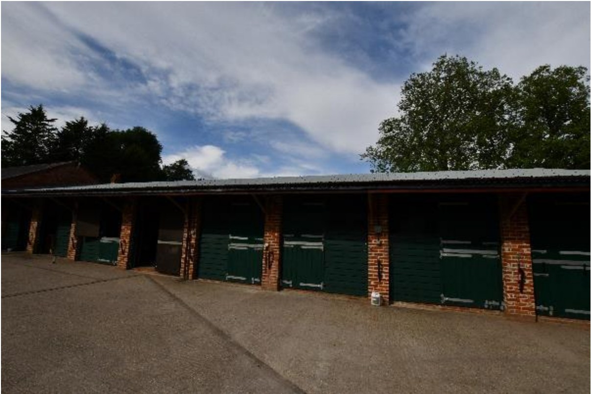
Image 9 External view of stables