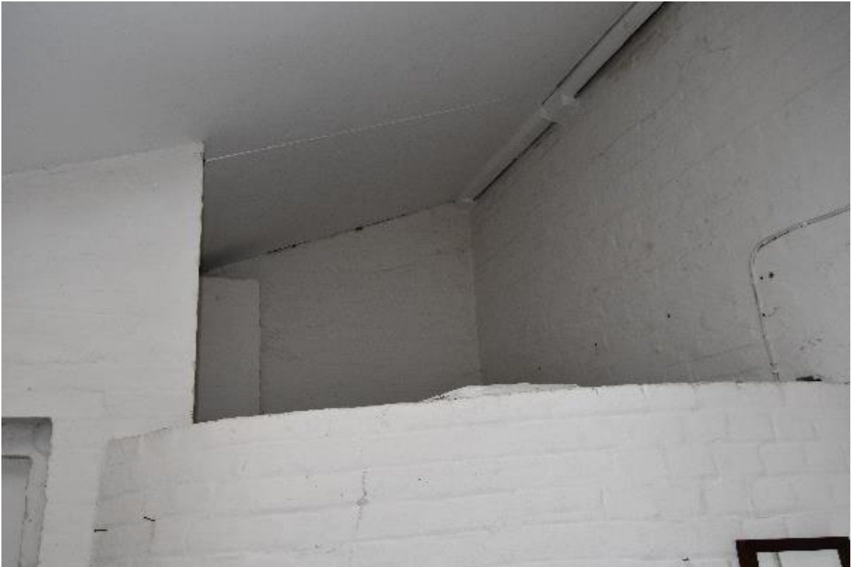
Image 3 Roof structure of Bread Oven