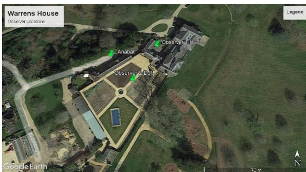
Figure 2 Observer Locations

There was a lack of potential roosting features in all the buildings examined in this commission. There were no signs of bats in the form of droppings or staining.