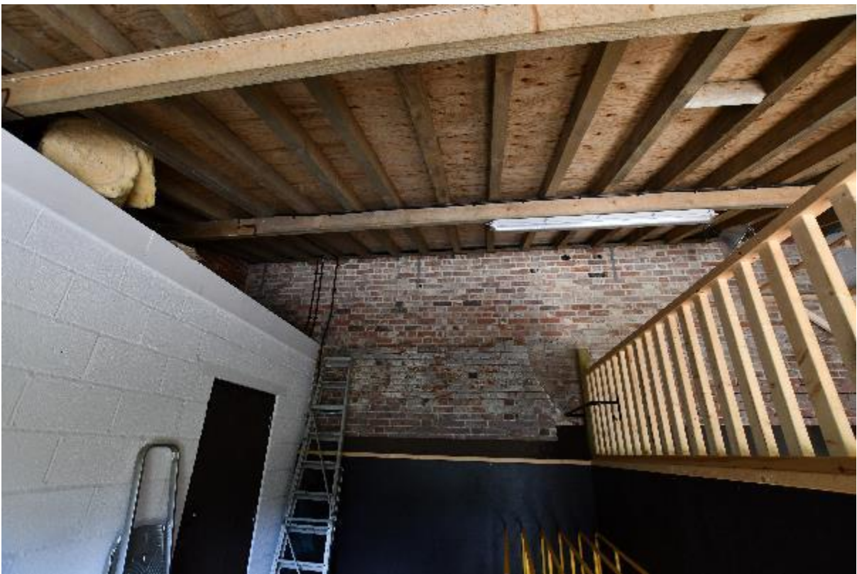
Image 10 Internal structure of stables