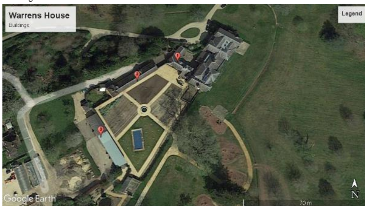
Figure 2 Target Buildings