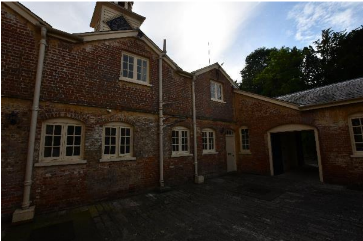
Image 2 Other buildings within courtyard