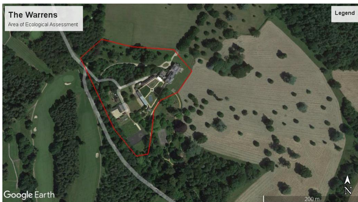
FIGURE 1. Area of Ecological Assessment as indicated by the red line.