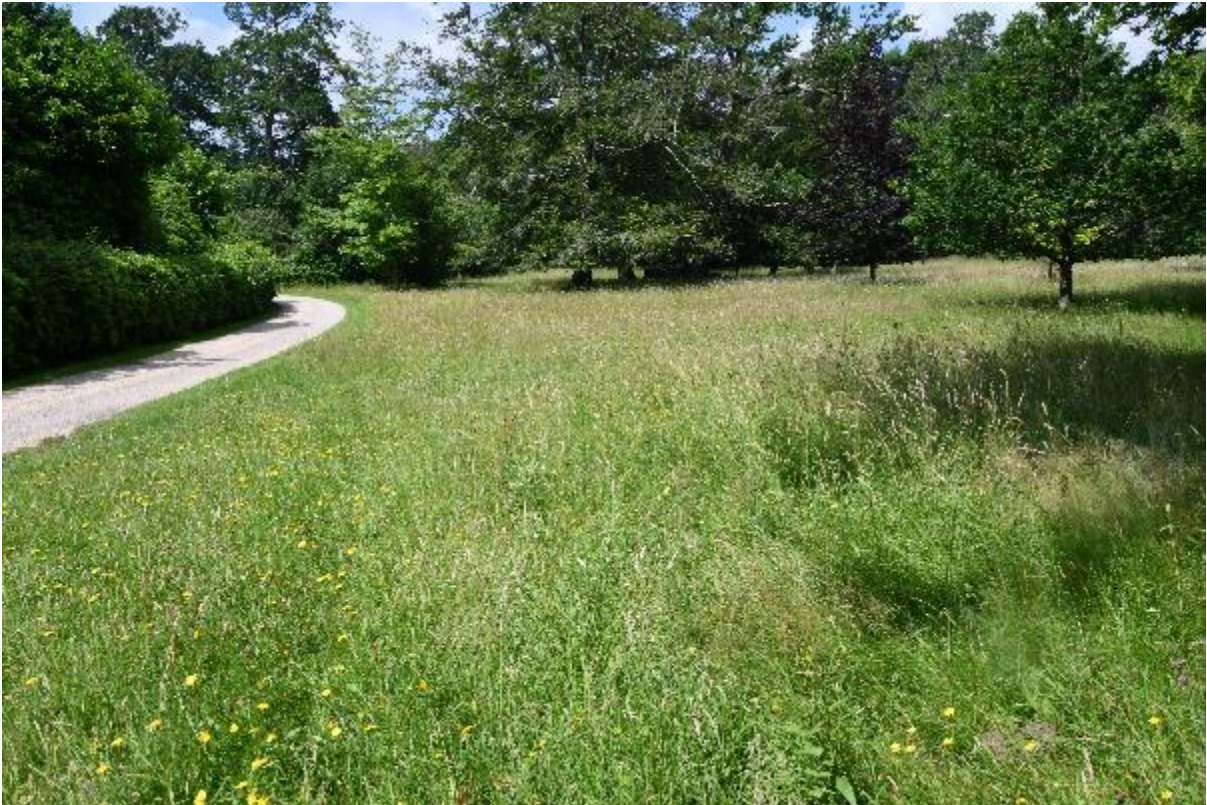
Image 15 Species Rich grassland