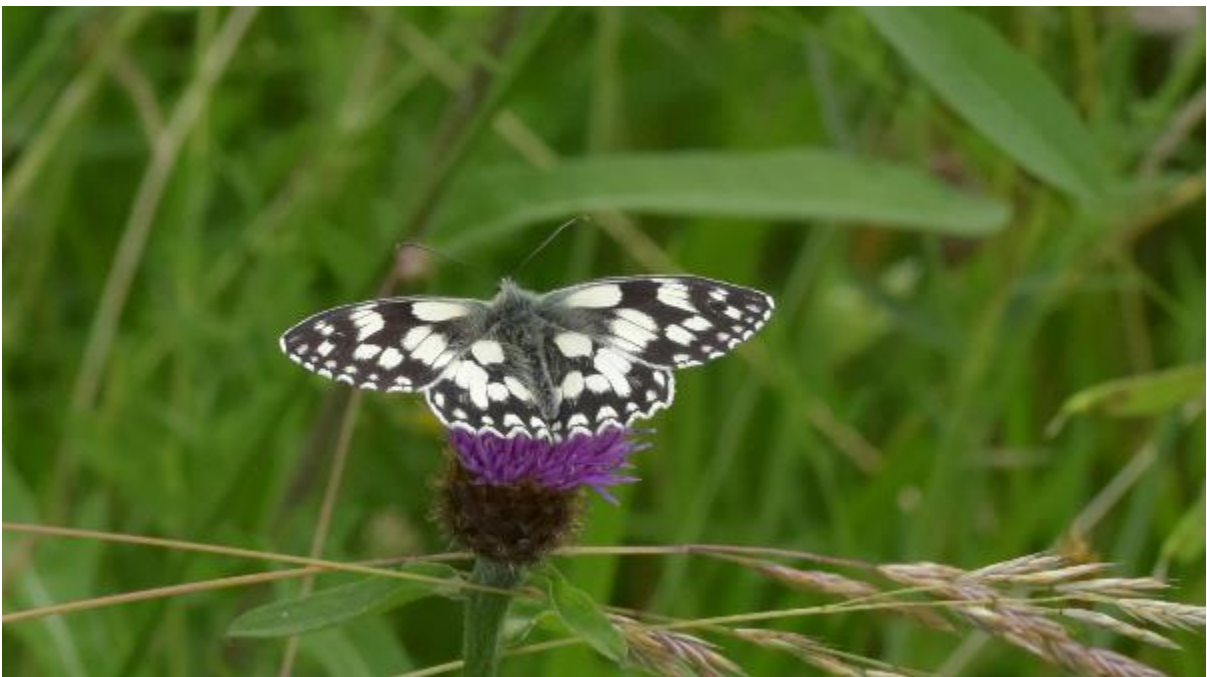
Image 16 Marbled white butterfly on common knapweed