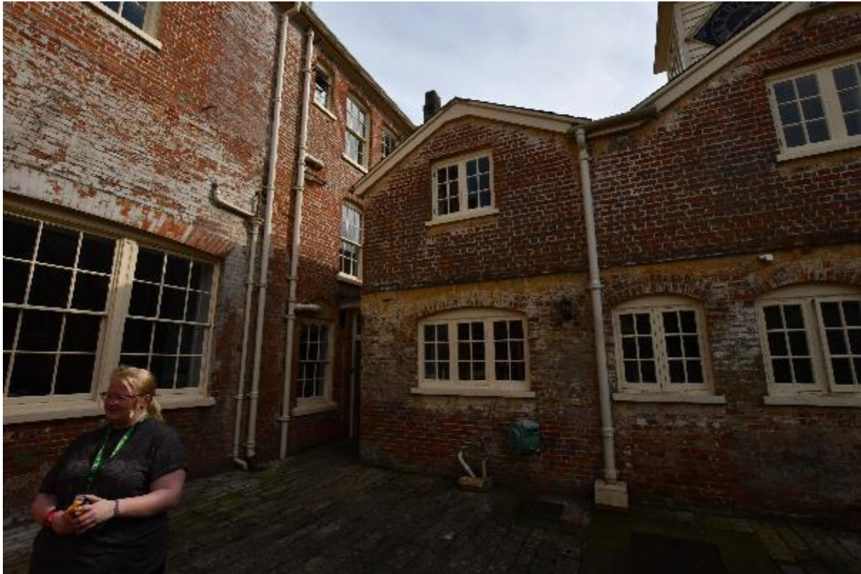
Image 1 Buildings within courtyard