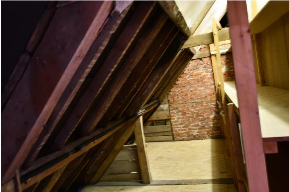
Image 7 Internal structures within Estate Office