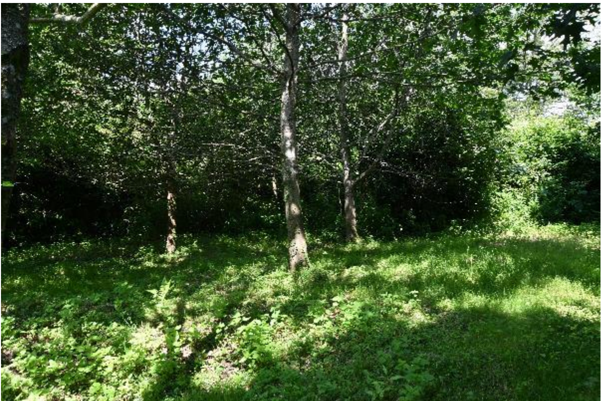
Image 12 Young trees in centre of small woodland copses