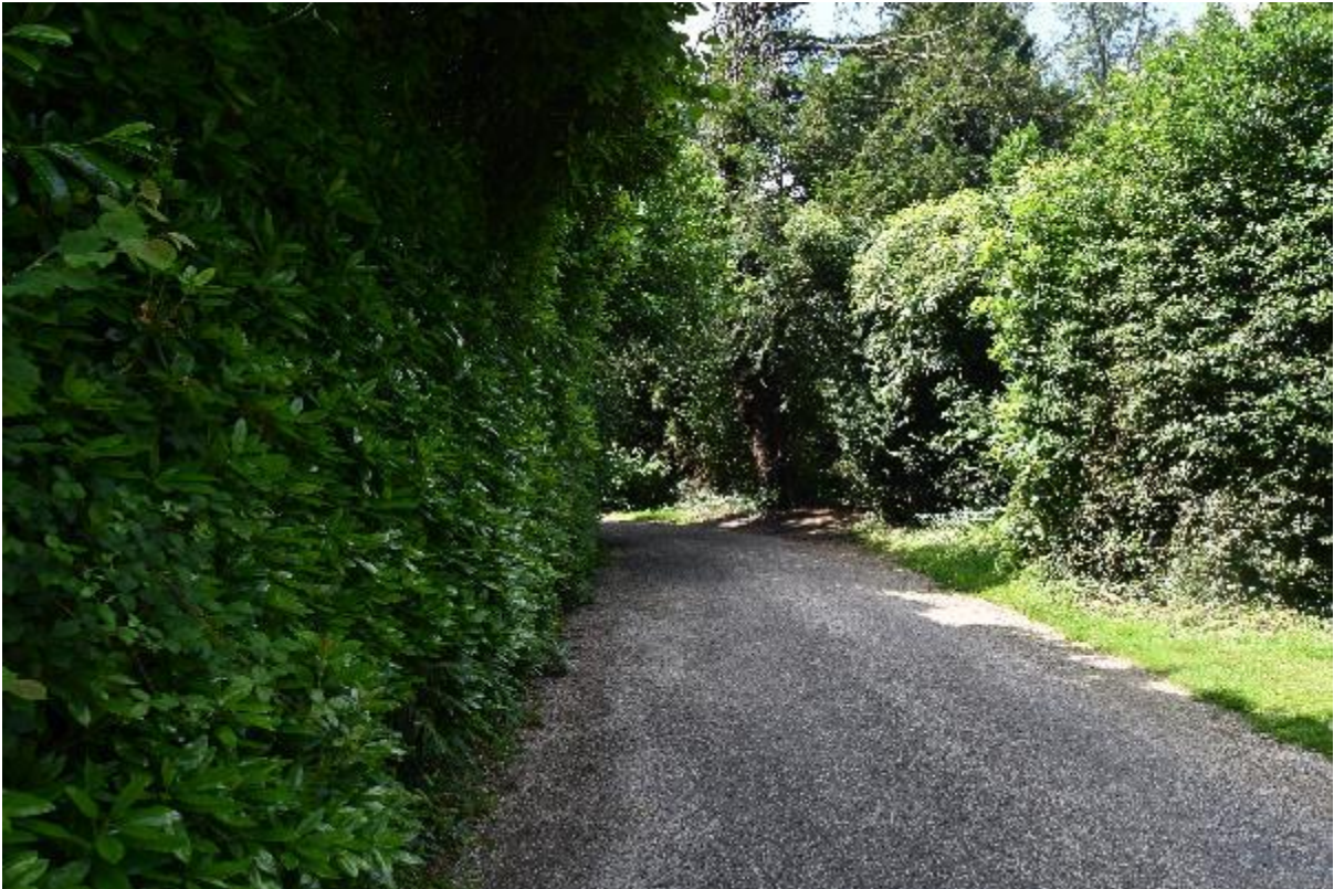
Image 11 Laurel and Rhododendron around access tracks