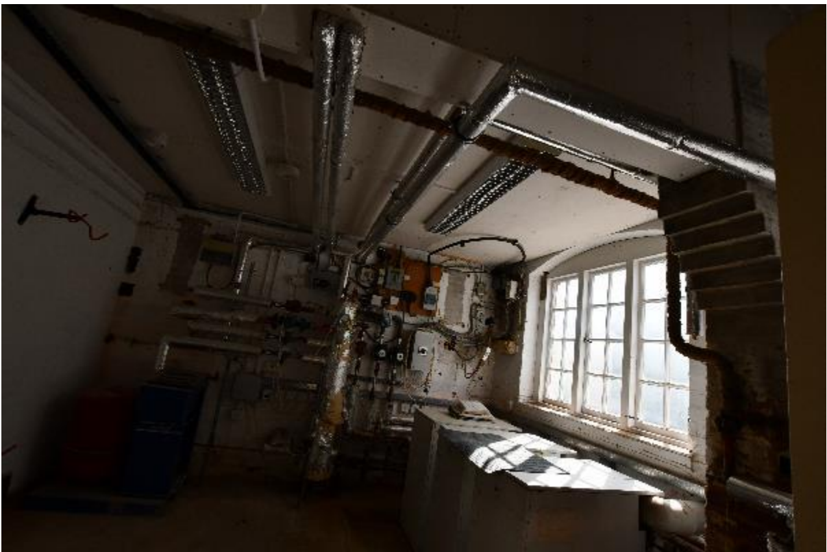
Image 4 Internal view of boiler house