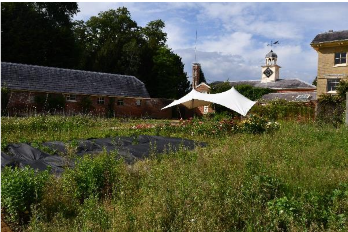
Image 6 Estate Office from Kitchen Garden