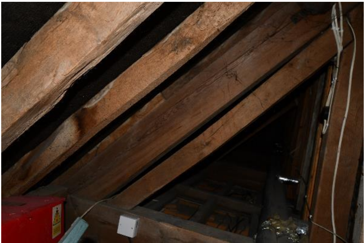
Image 8 Small roof void in Estate Office