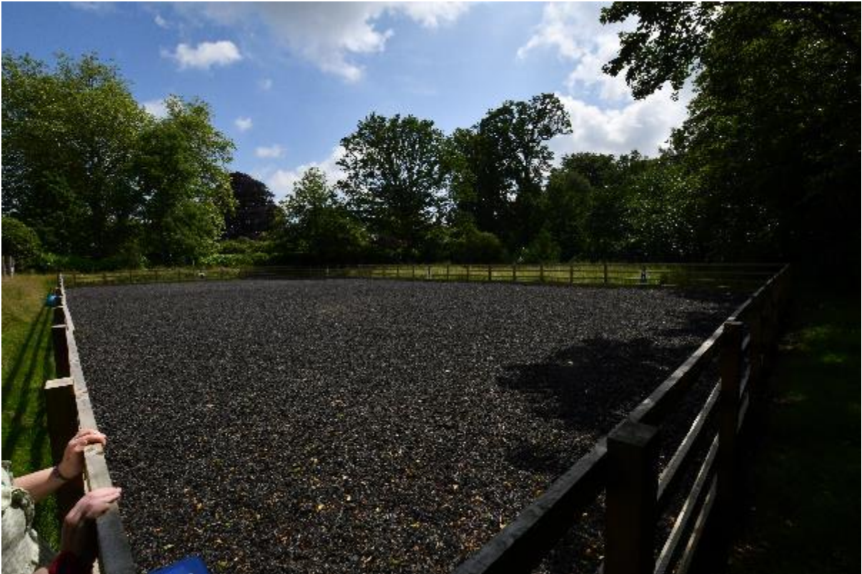
Image 13 Outdoor Menage