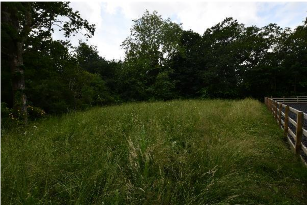
Image 14 Rough grassland adjacent to Menage