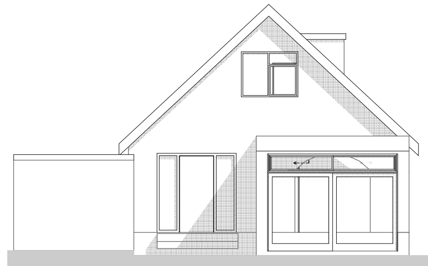
03 EXISTING NORTH ELEVATION Scale 1:100