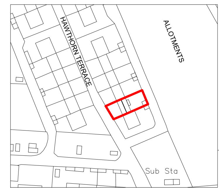
Location Map (1:1250)