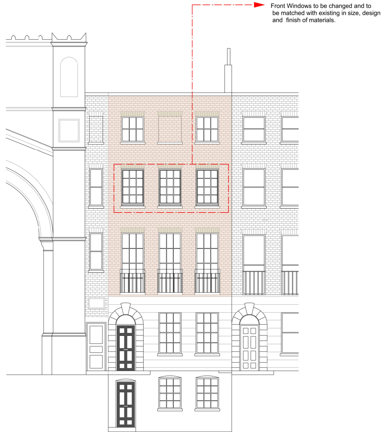
Existing and Proposed Front Elevation