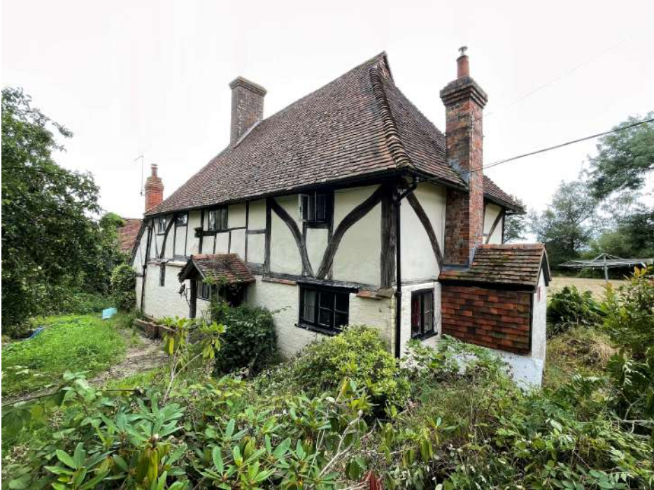
Front Elevation – Main house