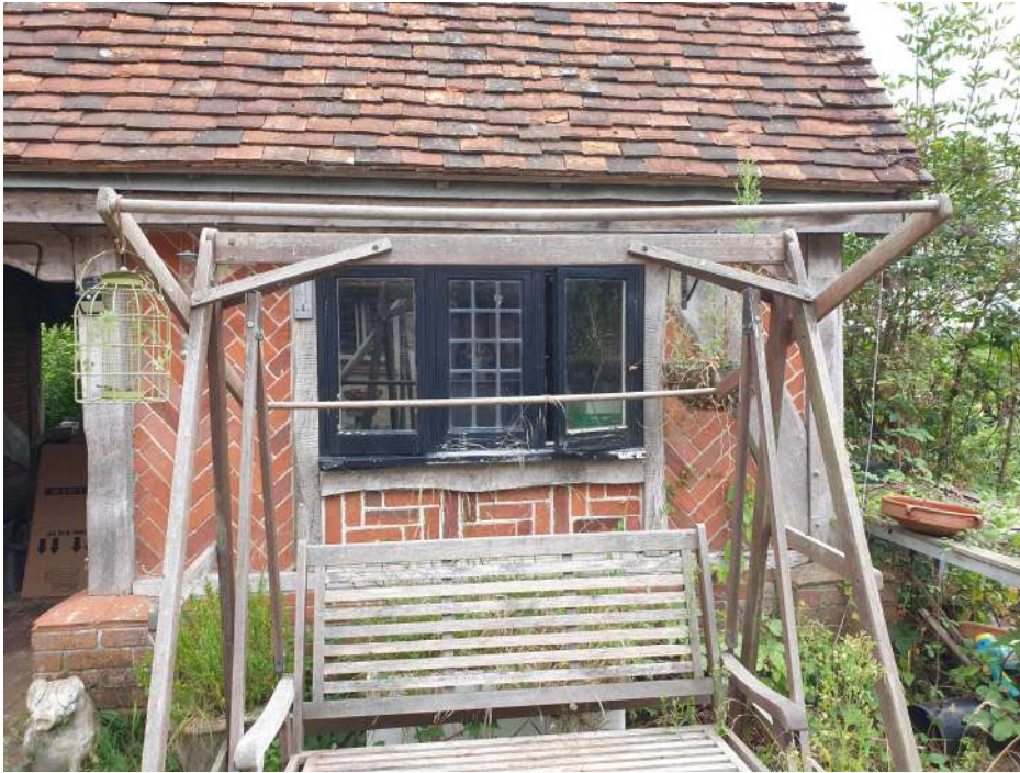
Front Elevation - Laundry/Store-room window