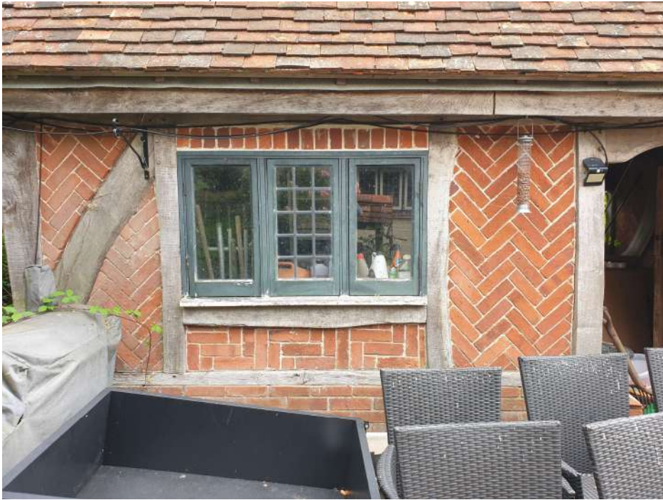
Front Elevation - Laundry/Store-room window