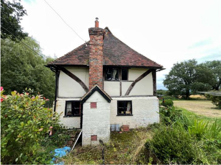
Side Elevation – Main house