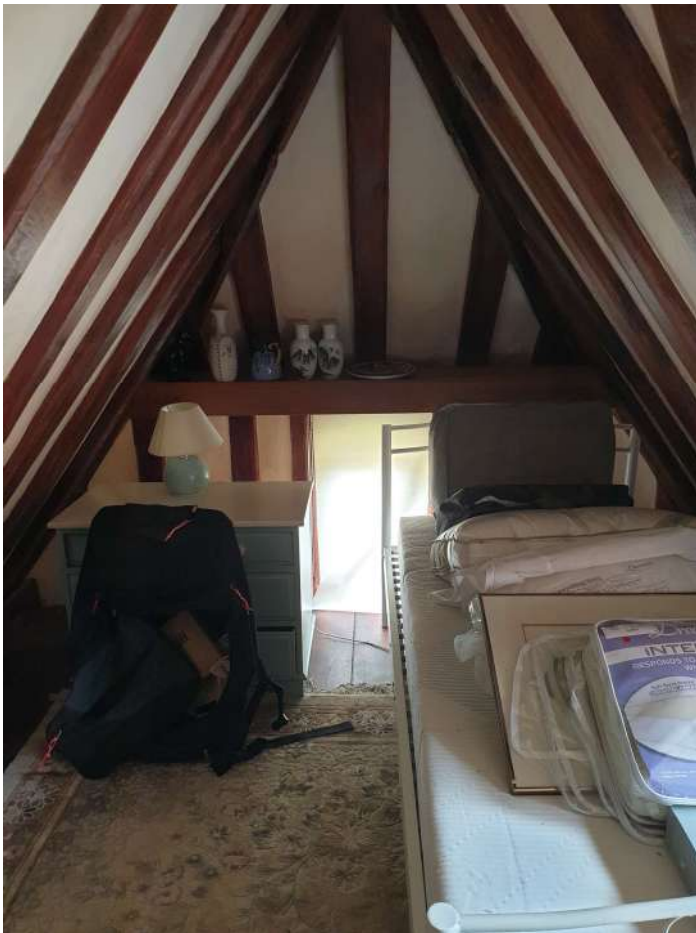
Bedroom 4 - Illustrating restricted height