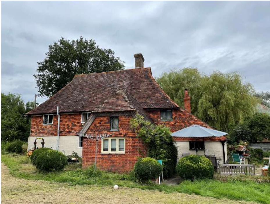
Rear Elevation - Main house