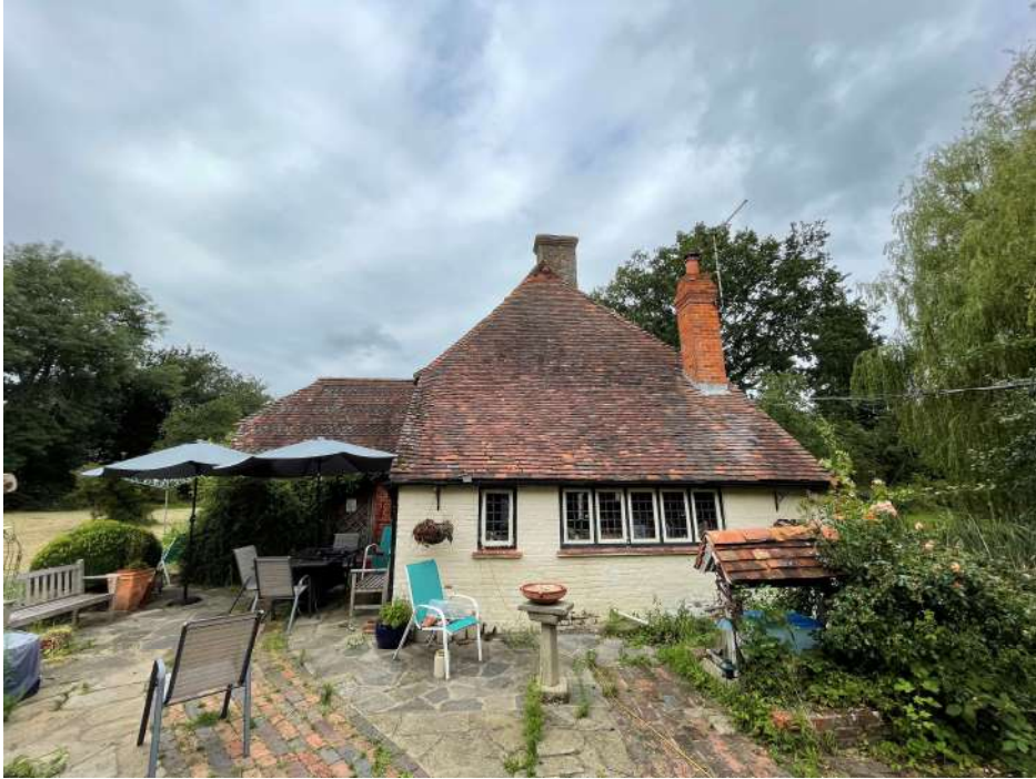
Side Elevation – Main house