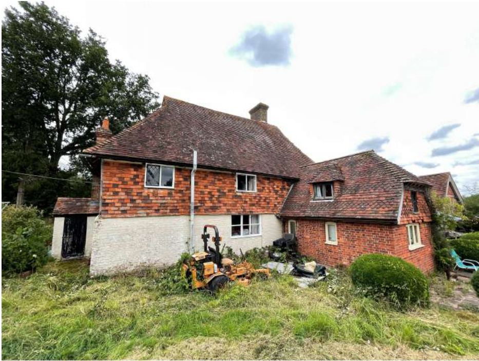
Rear Elevation – Main house