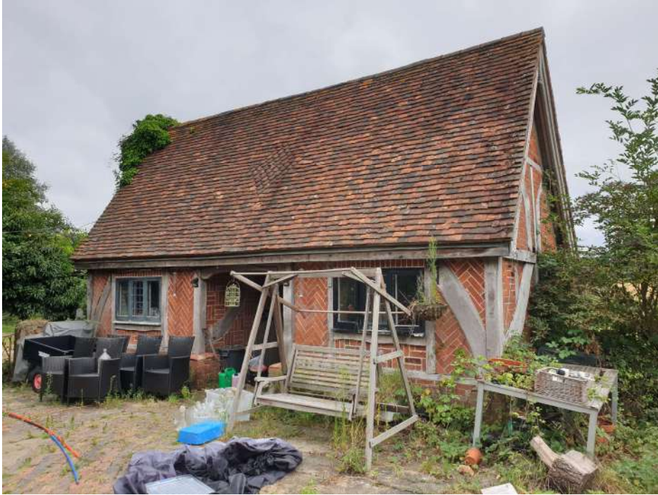
Front Elevation - Laundry/Store-room