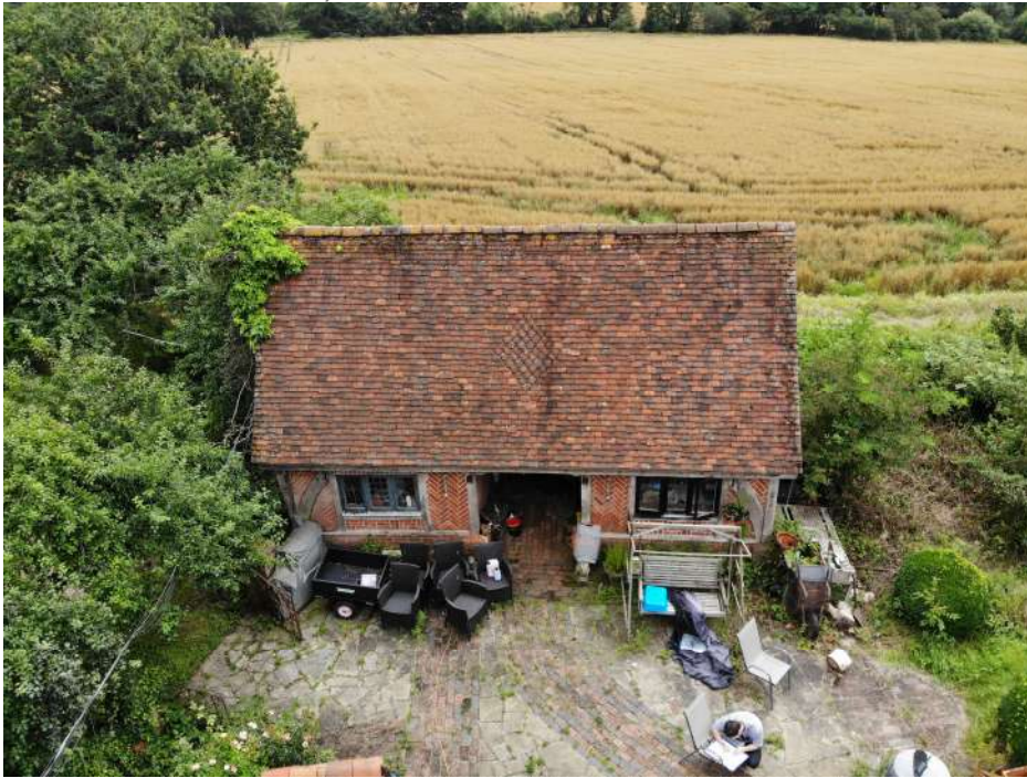
Front Elevation - Laundry/Store-room aerial view