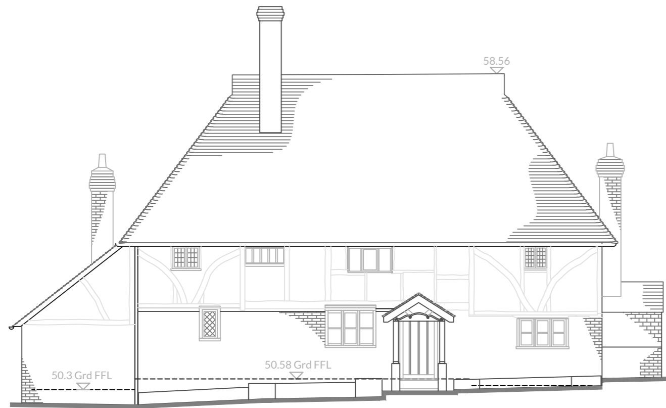
North East (Front) Elevation