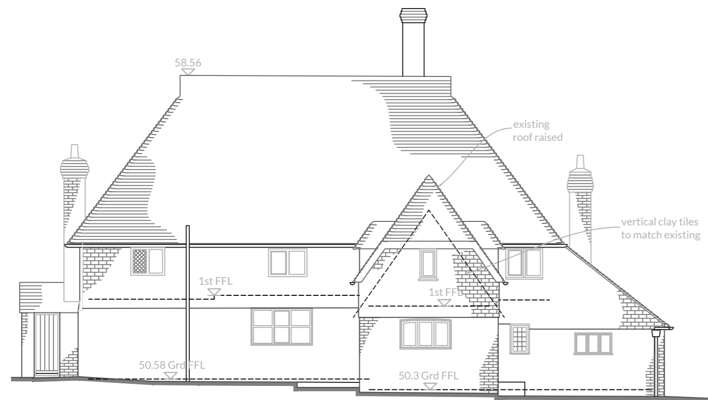
South West (Rear) Elevation