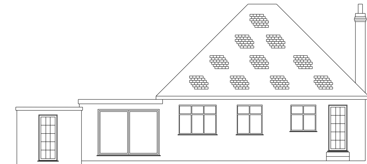
Existing West Elevation