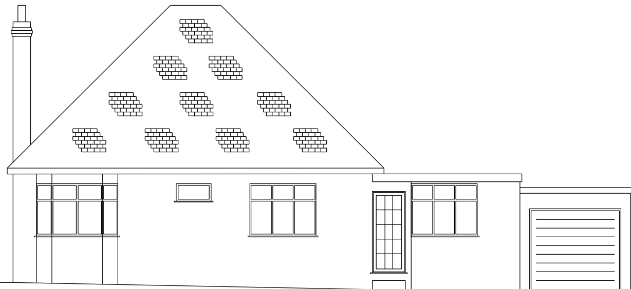
Existing East Elevation