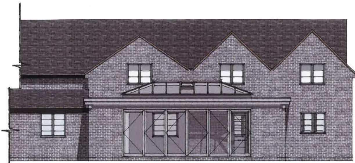
PROPOSED REAR (WEST) ELEVATION