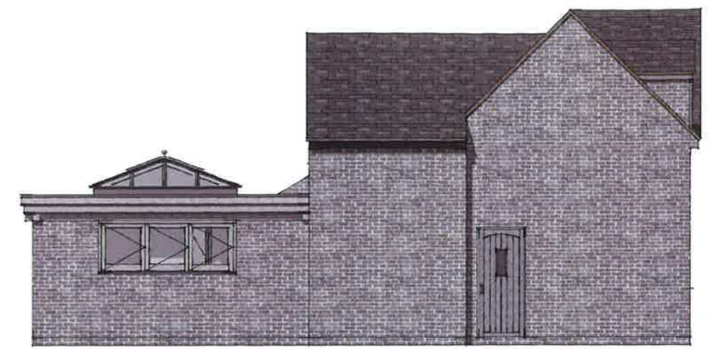
PROPOSED SIDE (SOUTH) ELEVATION