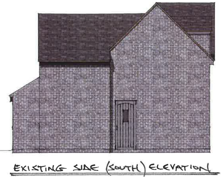
EXISTING SIDE (SOUTH) ELEVATION