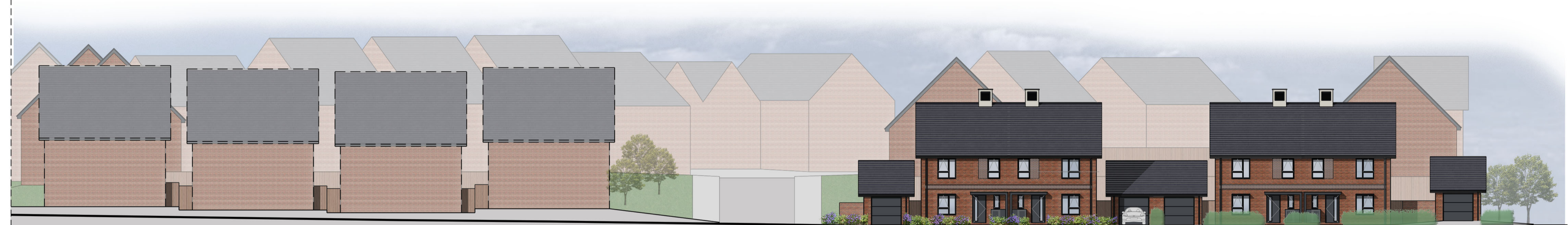
PLOT 85 CUSTOM BUILD PLOT 86 CUSTOM BUILD PLOT 87 CUSTOM BUILD PLOT 88 CUSTOM BUILD PLOT 89 HOUSE TYPE CH4B PLOT 90 HOUSE TYPE CH4B PLOT 91 HOUSE TYPE CH4B PLOT 92 HOUSE TYPE CH4B PLOT 93 HOUSE TYPE CH4B PLOT 94 HOUSE TYPE CH4B

Future Custom and Self Build Dwellings Subject to Detailed Design