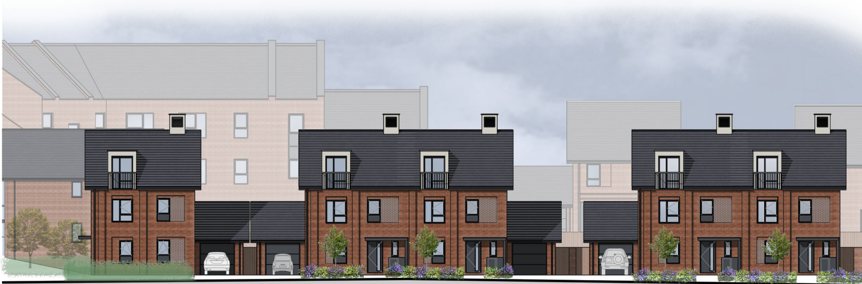
PLOT 84 HOUSE TYPE CH4C PLOT 83 HOUSE TYPE CH4A PLOT 82 HOUSE TYPE CH4A PLOT 81 HOUSE TYPE CH4A PLOT 80 HOUSE TYPE CH4A