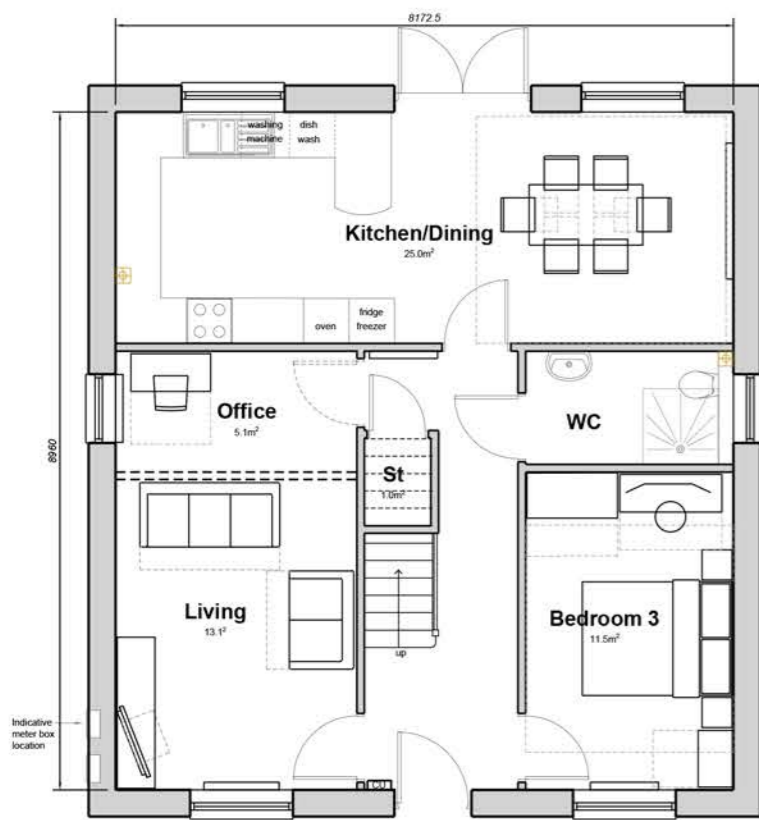
GROUND FLOOR - 73.3m 2