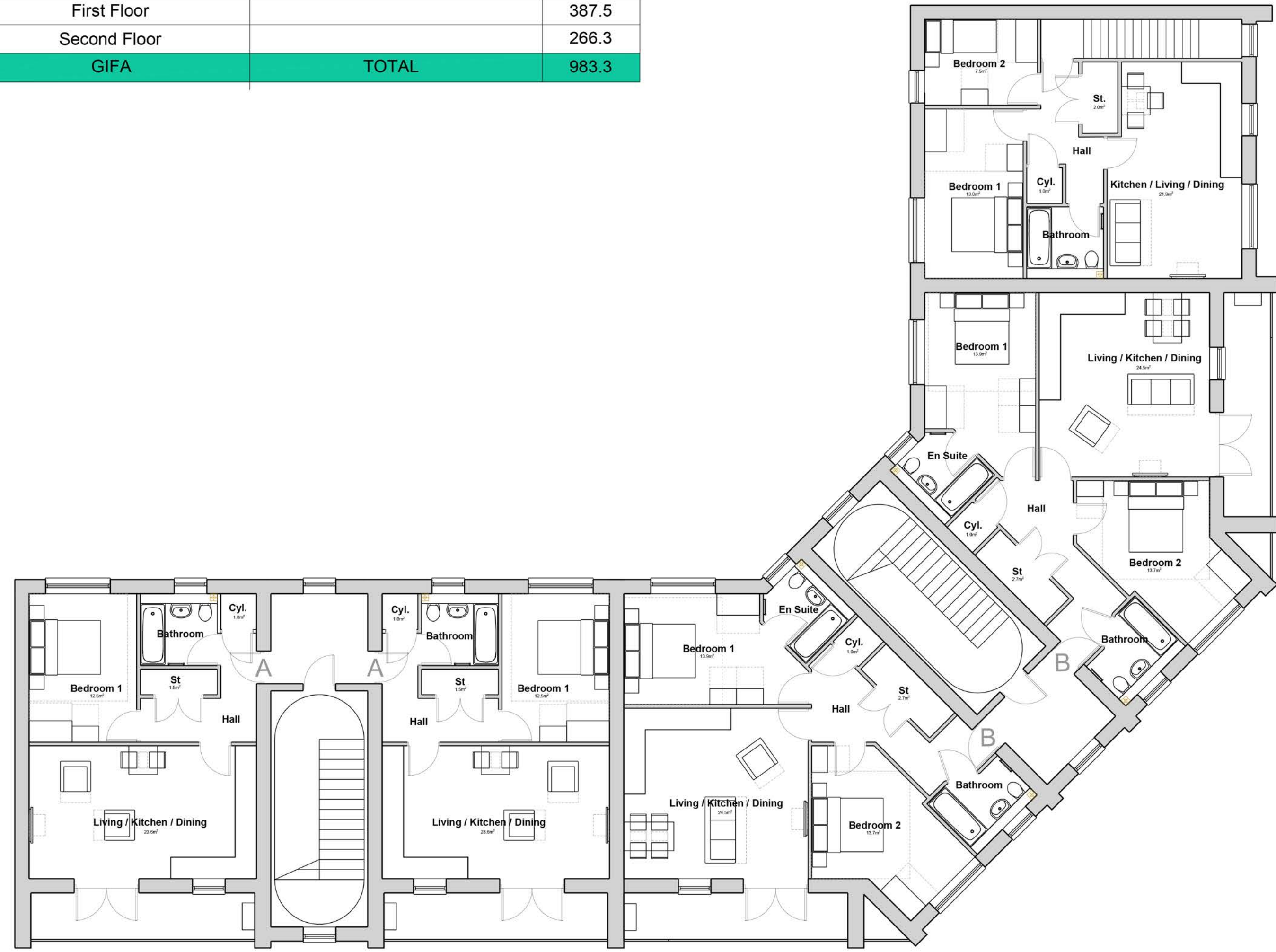
First Floor Plan Scale 1:100