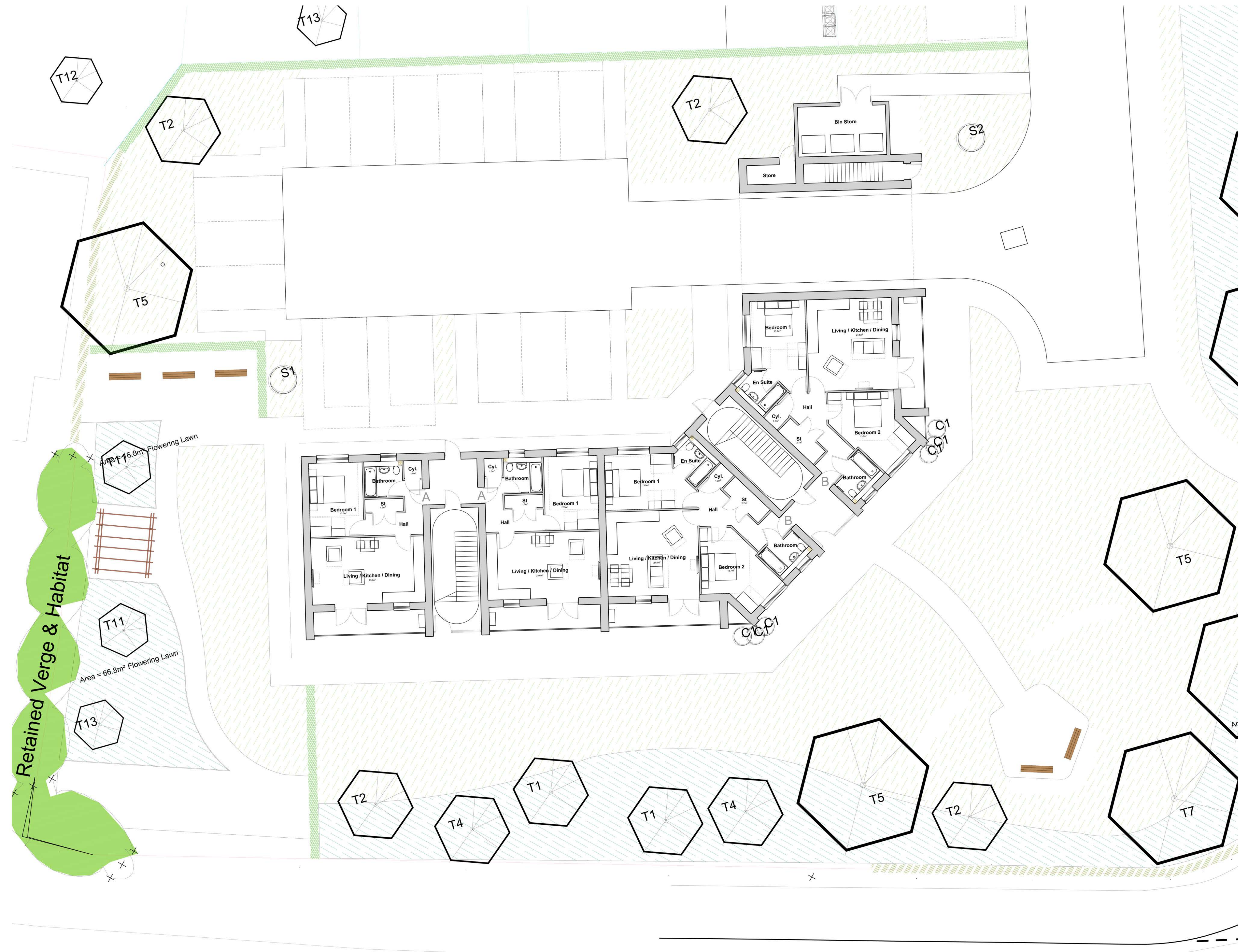
Ground Floor Plan Scale 1:100