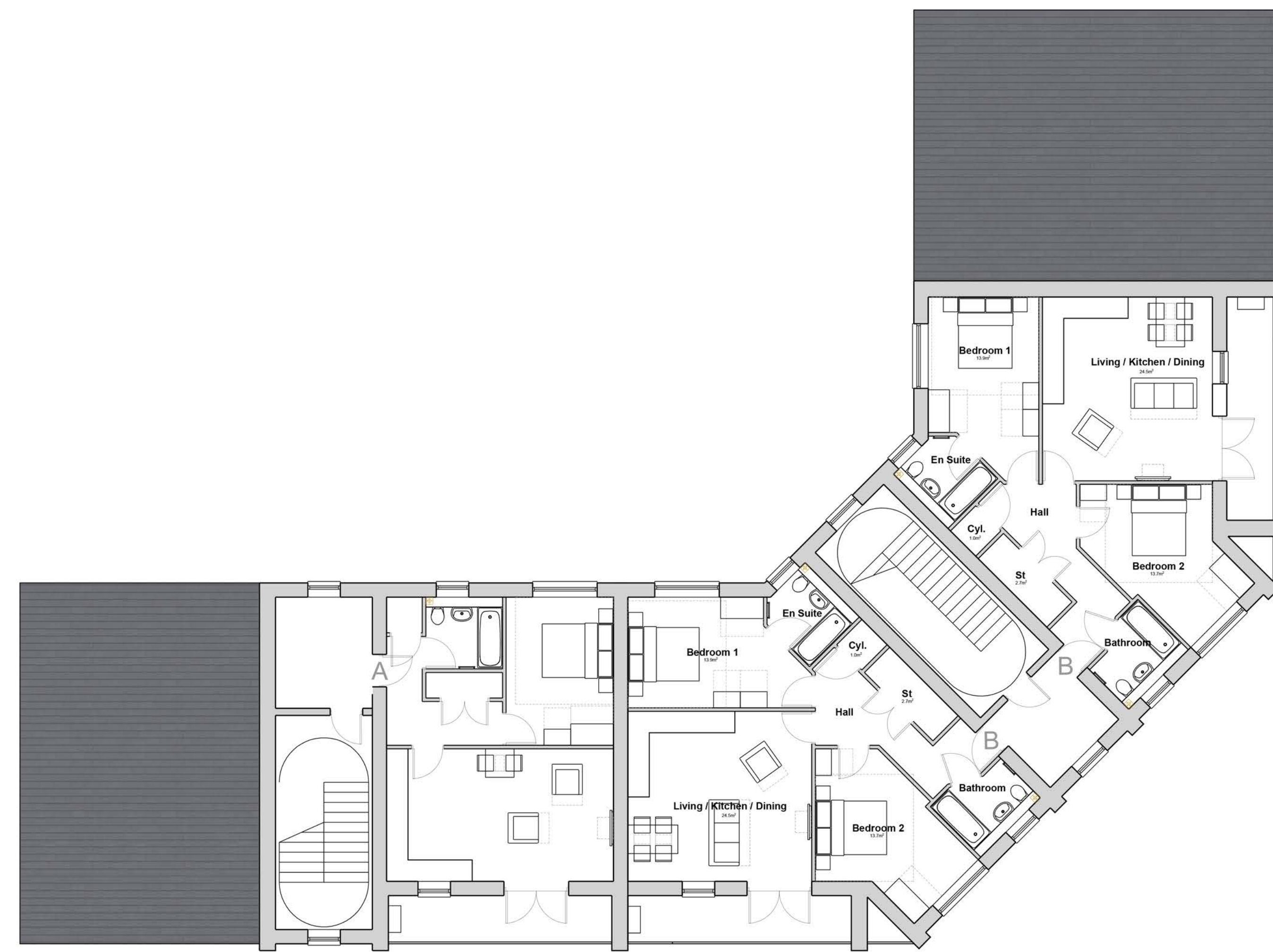
Second Floor Plan Scale 1:100