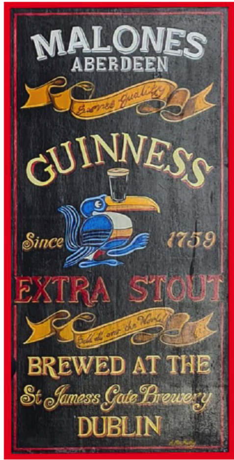
Guinness Sign 1500 x 2800mm