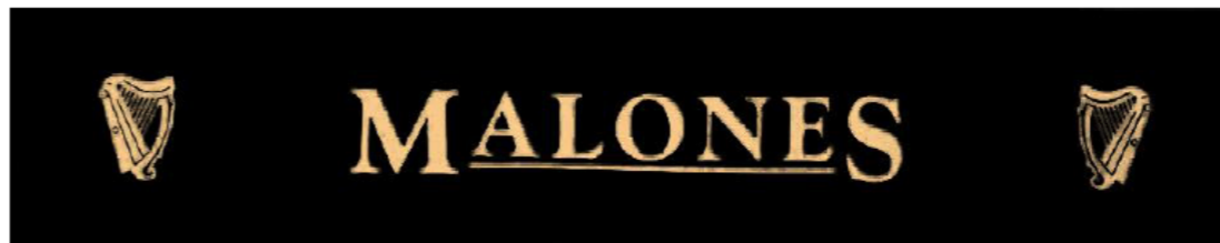
Malones Sign 4000 x 650mm