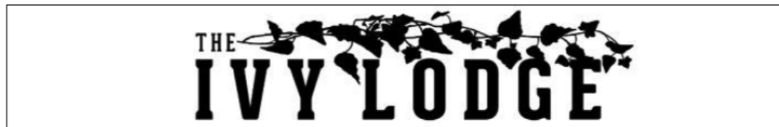
Ivy Lodge Sign 6000 x 1000mm