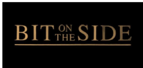
Bit on the Side Sign 1500 x 600mm