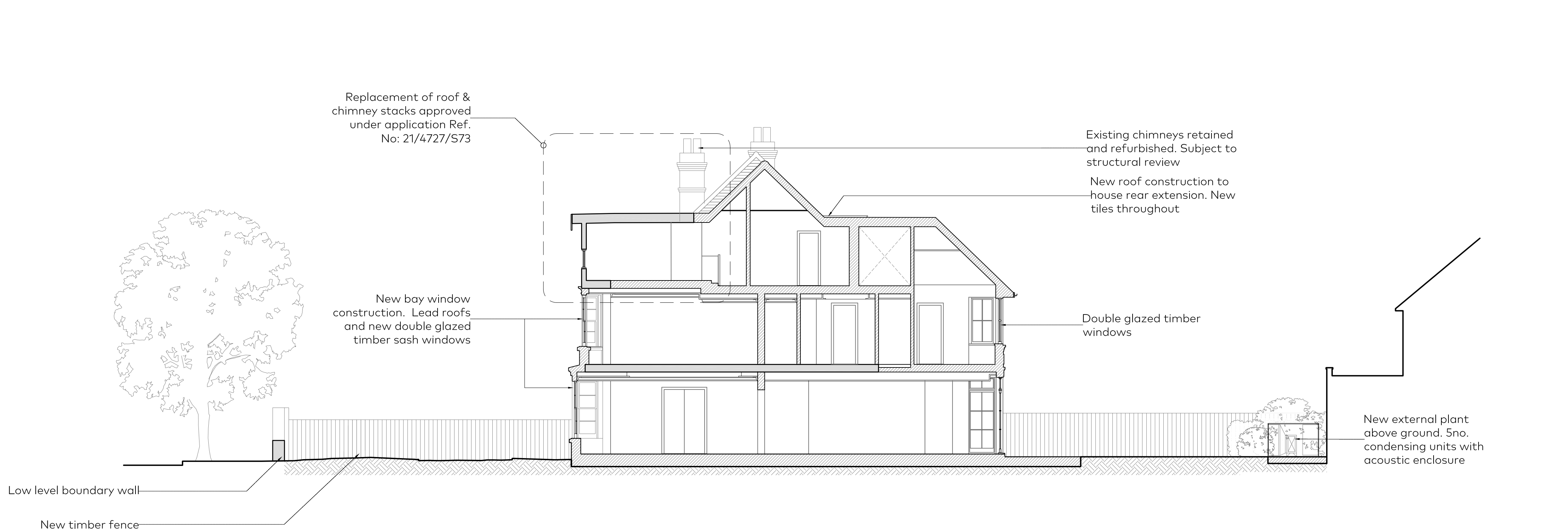
01 (PL)701 Section C As Proposed