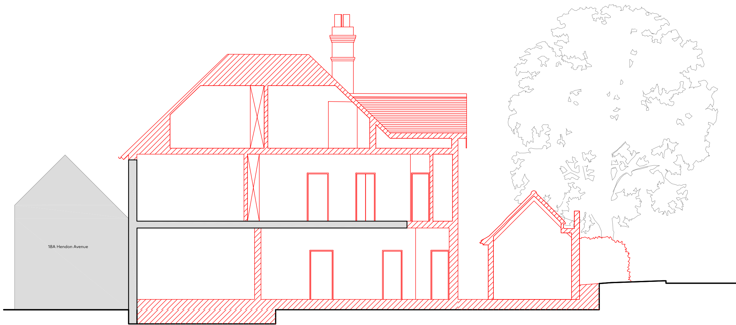
02 Section B (PL)300 As Existing with Demolition